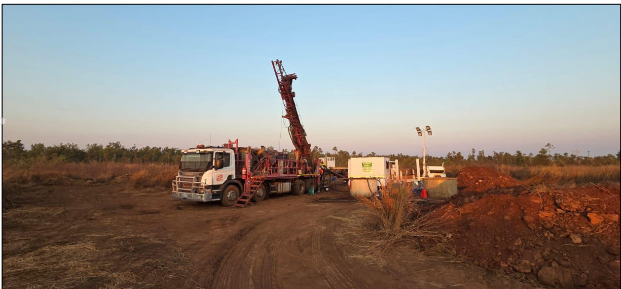
Figure 1 – DeSoto Resources drilling at the Spectrum Project, Vesper Target, in the Northern Territory, Australia.