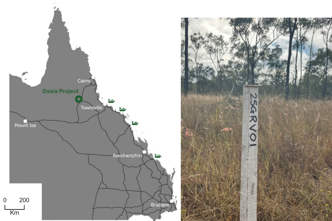
Figure 1 – Location map of the Oasis Uranium Project and drill collar pegged for maiden drill program

The acquisition of the Oasis Project adds an advanced exploration asset to the Company's Australian uranium portfolio. Historical exploration results 1 have confirmed that Oasis hosts high-grade uranium mineralisation, with multiple high-confidence drill targets ready to be tested.