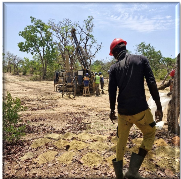
Figures 2 & 3 \ AC drilling at Ferké Gold Project