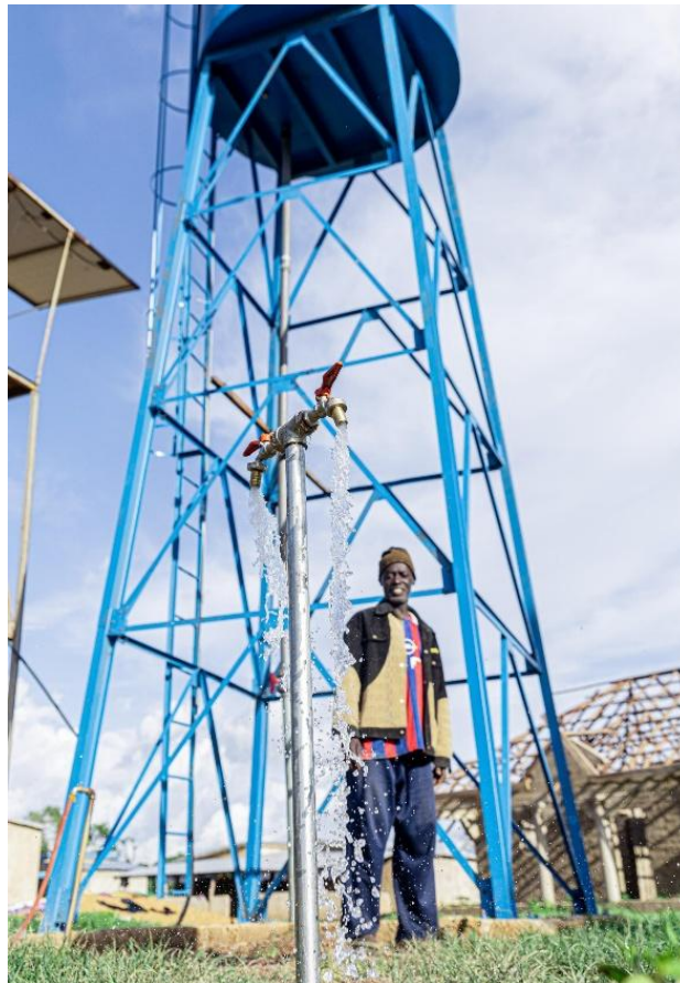
Figure 5: Toubani sponsored the installation of a new water tower for the Faraba village

Regular meetings with local government authorities were held throughout the quarter to exchange information and provide feedback on development activities as they progress. Additionally, Toubani further bolstered its site team with the appointment of a Community and Environment Manager.