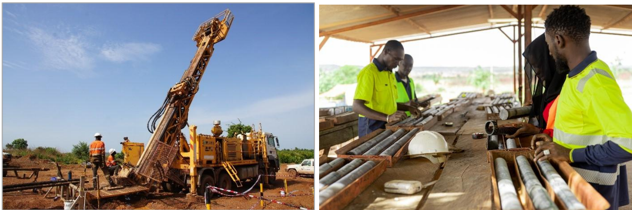
Figure 2: High impact diamond drilling underway at the Kobada Gold Project

Together, these drilling programs reflect Toubani’s dual-track strategy: readying Kobada for development while unlocking the full potential of the Kobada deposit as the Company works towards a final investment decision by the end of 2025.