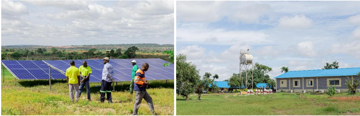
Figure 3: New solar power installation and refurbished camp