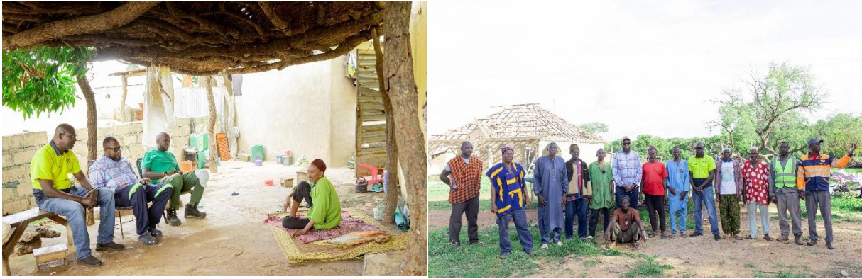
Figure 4: Community consultation with surrounding villages of Kobada

Recent engagement and discussion with the local people of Faraba resulted in Toubani supporting the community with a new water tank which is now installed and in use. We will continue to work closely with local community groups to develop long-term opportunities for positive social impact.