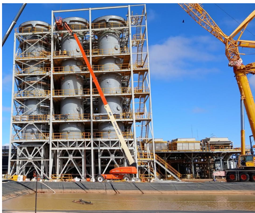
Figure 1: NIMCIX columns 4 to 6 installed

Along with the process plant construction, wellfield construction continues with wellfield 4 complete and in flushing, and wellfield 5 to be complete and commissioned in Q3 CY25. East Kalkaroo trunkline materials are on site, with construction to begin in August.