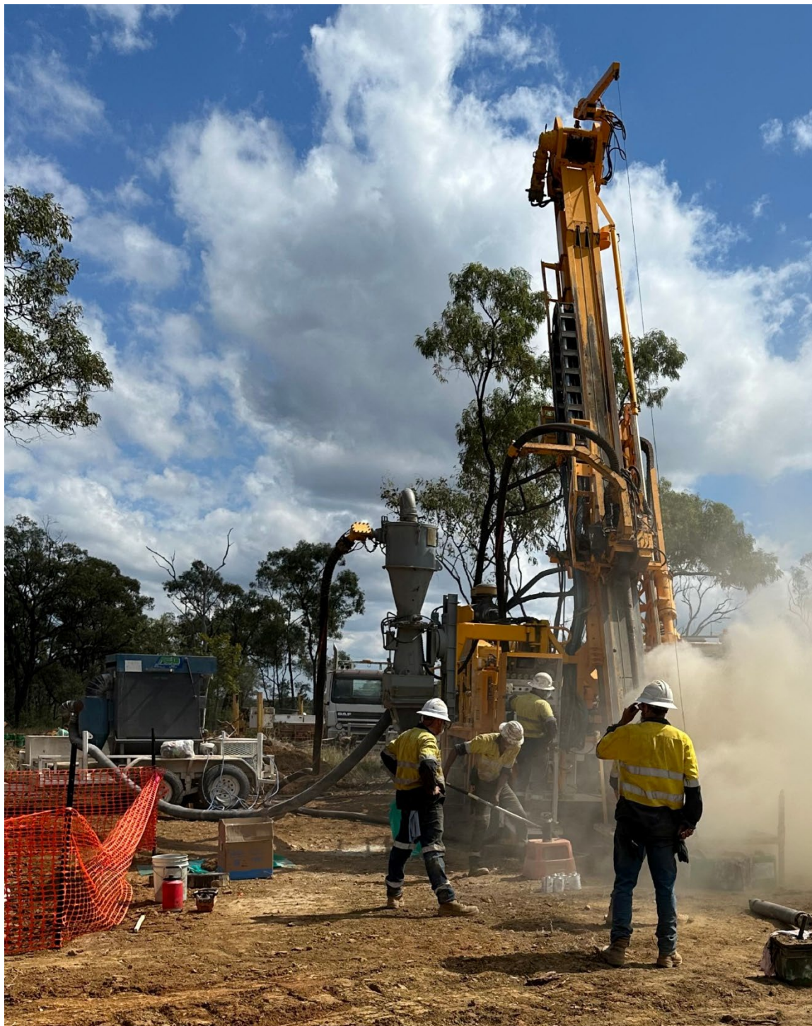
Figure 1 – Drill rig set up and commencing RC collar for drill-hole 25GRV01