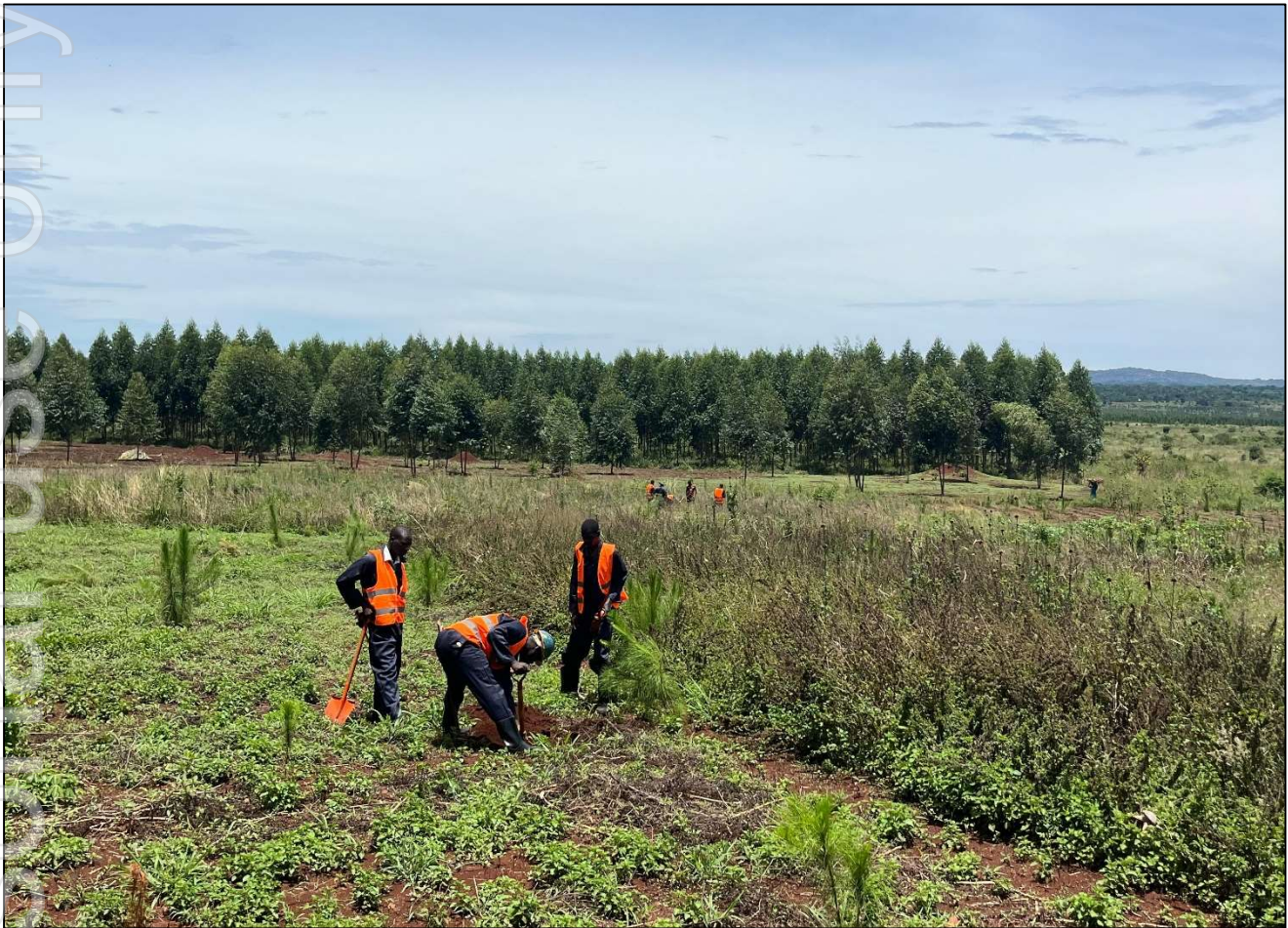
Figure 2: Field crew digging a hole to take a soil sample.