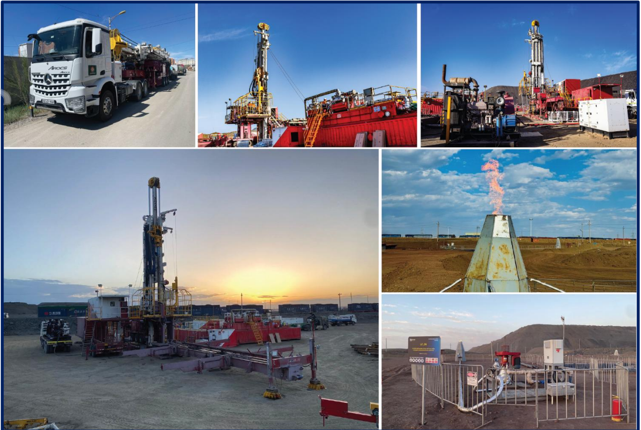
Figure 2: Major Drilling's TXD200 being mobilised to site, rigging up, and existing pilot wells producing gas.