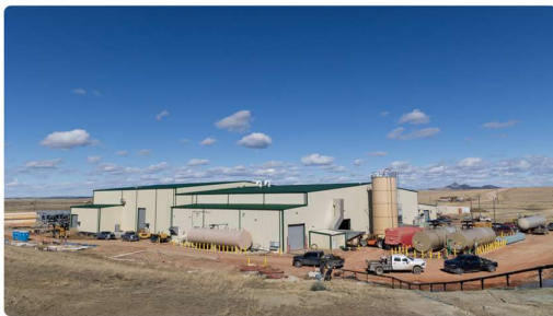
Central Processing Plant (Phase I & II)