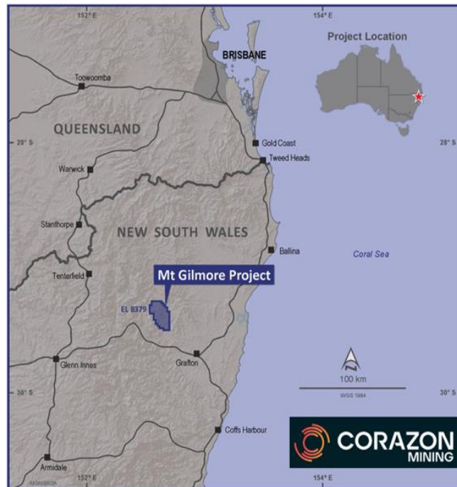
Figure 3 – Mt Gilmore Project location map

A geochemical testwork program undertaken with the University of Tasmania’s Centre of Ore Deposit and Earth Sciences confirmed that Mt Gilmore hosts key geochemical characteristics specific to large porphyry copper–gold deposits (ASX announcement 12 July 2022 and 4 October 2022).