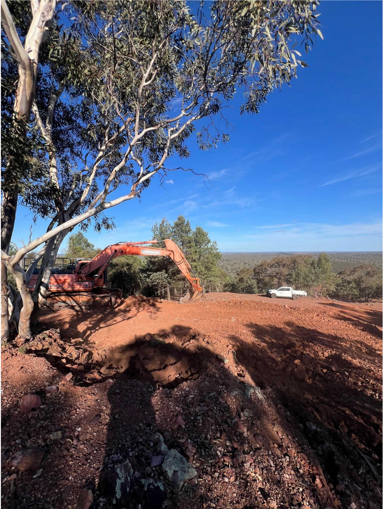
Figure 1: Mt Solitary drill pad/track construction