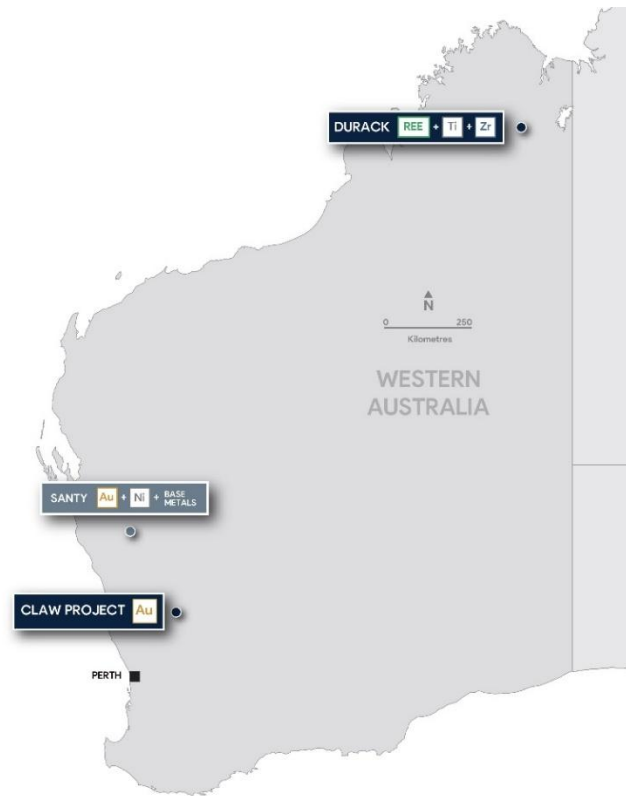
BPM Minerals Western Australian Projects