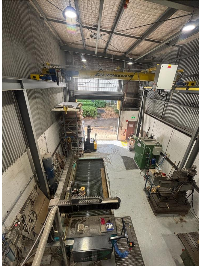
Figure 3 – CSIRO Queensland (Engineering Workshop)