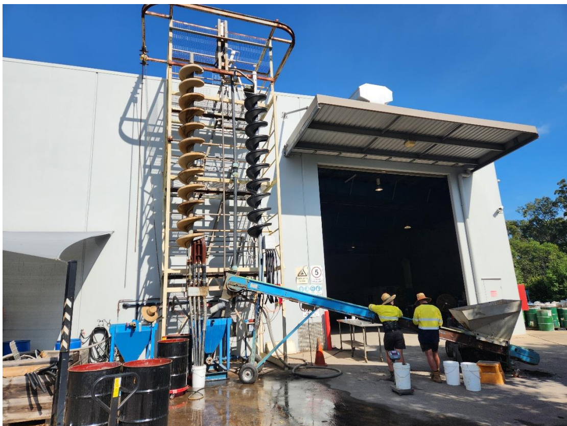
Figure 2 – IHC Mining bulk sample processing

The Company believes the opportunity will be complimentary to its existing portfolio of projects and is keen to receive final product testing results.