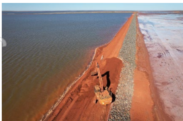
Figure 3: Rock Placement on Pond 5 Seawall