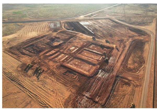
Figure 6: SOP Pilot Ponds