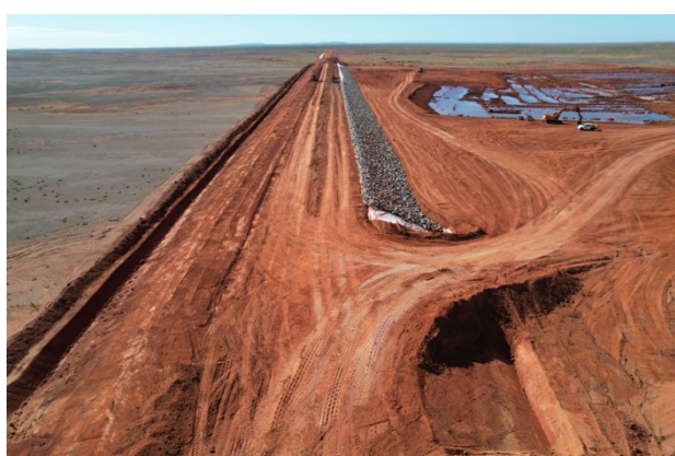
Figure 5: Pilbara Ports Road Construction