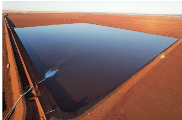
Figure 2: Filling Crystalliser C1-E1