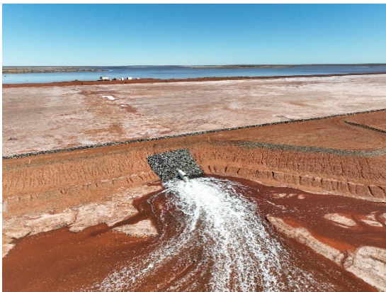
Figure 1: Commissioning Transfer Station 5/6

Fabrication of the salt harvester was awarded to Camco Engineering and progressed well in their Western Australian based facility.