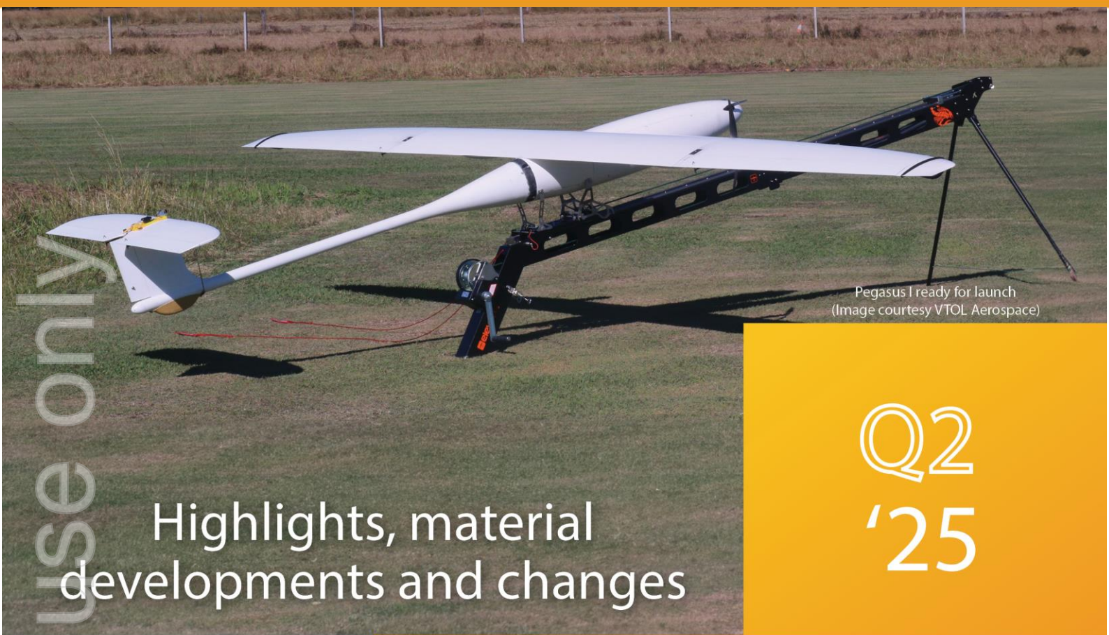
Pegasus I ready for launch