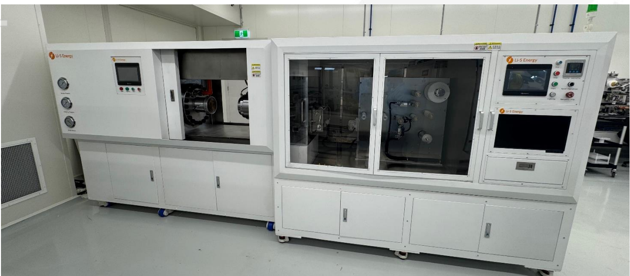
Li-S Energy's state of the art Lithium Foil Extruder - first lithium foil produced in Australia

This additional capability will increase the number of foil types the Company can offer to the global market, while enabling our team to further optimise the anode design in our own Li-S Energy cells.