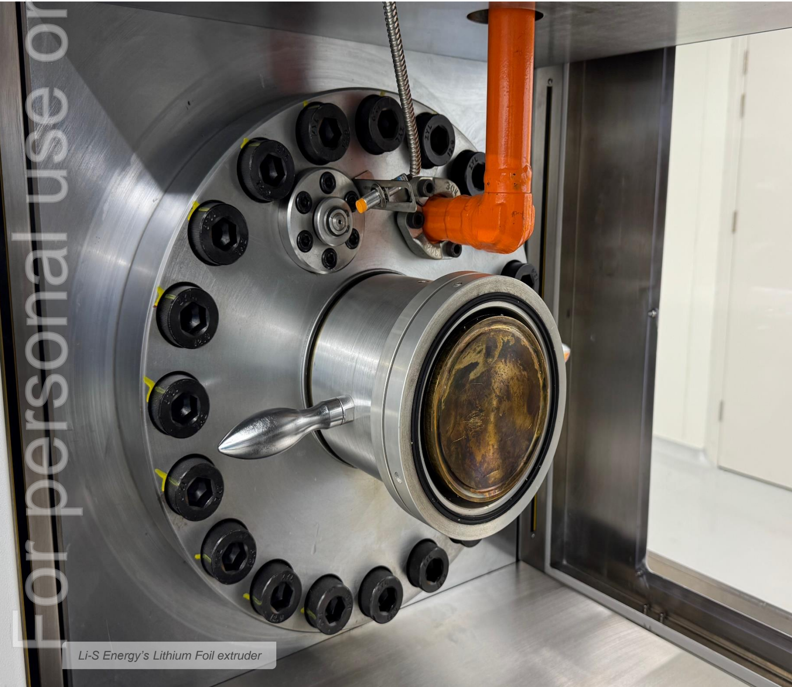
Li-S Energy's Lithium Foil extruder