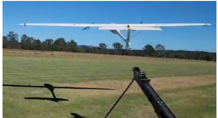
Pegasus I being tested from the catapult launch system

During the quarter, Li-S Energy and its partners made key advancements in the Pegasus I Drone Program. Pegasus I is a joint development with V-TOL Aerospace and HaloCell under the Emerging Aviation Technology Partnerships (EATP) program – a drone technology initiative backed by Australian government funding.