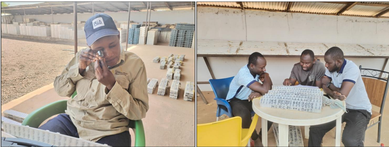
Figure 2: Ongoing RC and DD re-logging at the Niandankoro Camp core shed. The exercise has incorporated training of several junior geologists that recently joined the Project