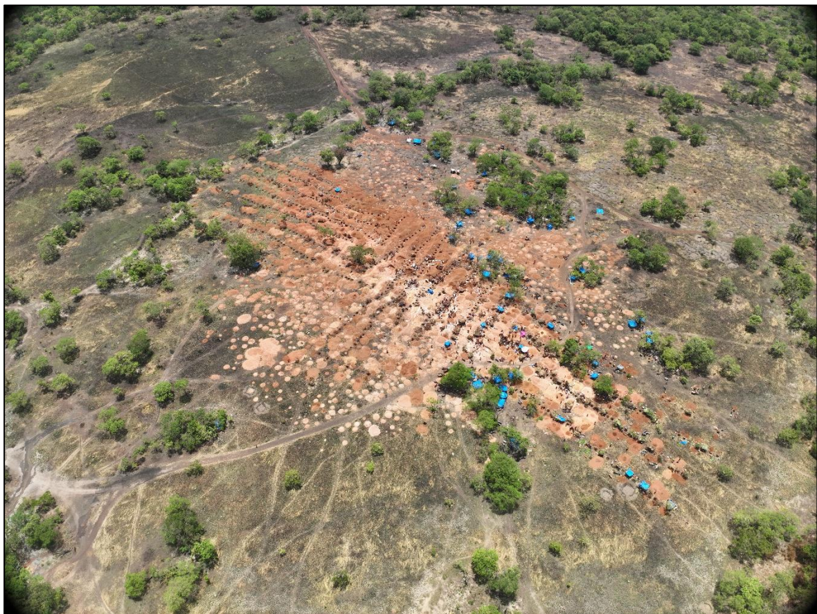
Figure 6: Drone surveys continue to assist in the identification of informal gold workings for follow-up investigation.