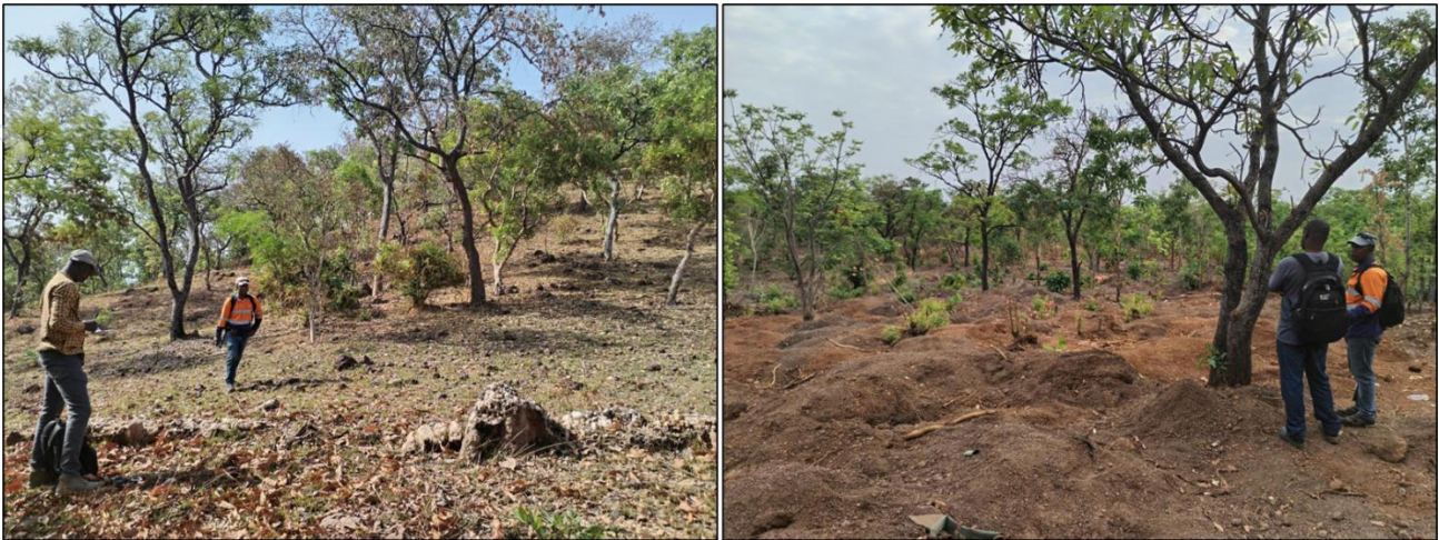
Figure 1: Regolith mapping of the Kada licence area identified several interesting structures and previously unidentified areas of artisanal workings.