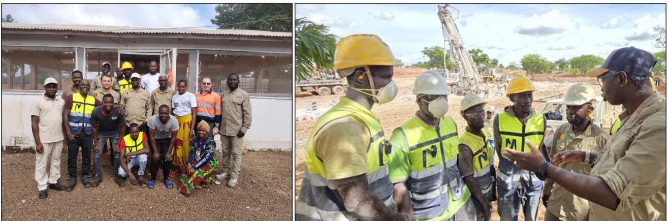
Figure 7: The Company is committed to equal opportunities employment of local talent and focused on training.

During the quarter, Asara continued to engage and collaborate with the communities surrounding Kada to lay the foundations for a mutually rewarding relationship moving forward. This included consultation with local communities and relevant stakeholders regarding the employment of field assistants and technicians to support the ongoing drill and exploration programs.