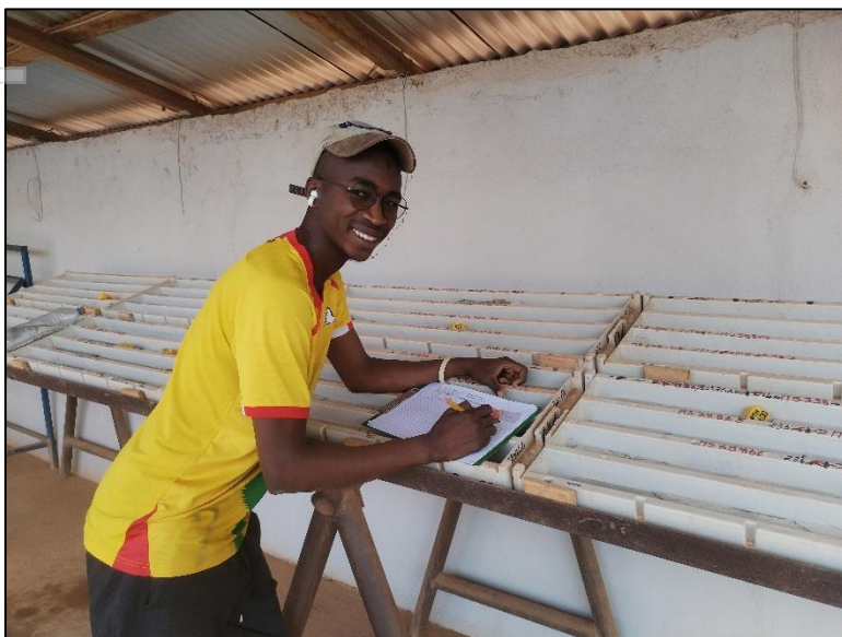
Figure 3: DD re-logging continues, focused on the Massan Deposit. Re-assessment of the downhole weathering profile will lead to concise re-modelling.