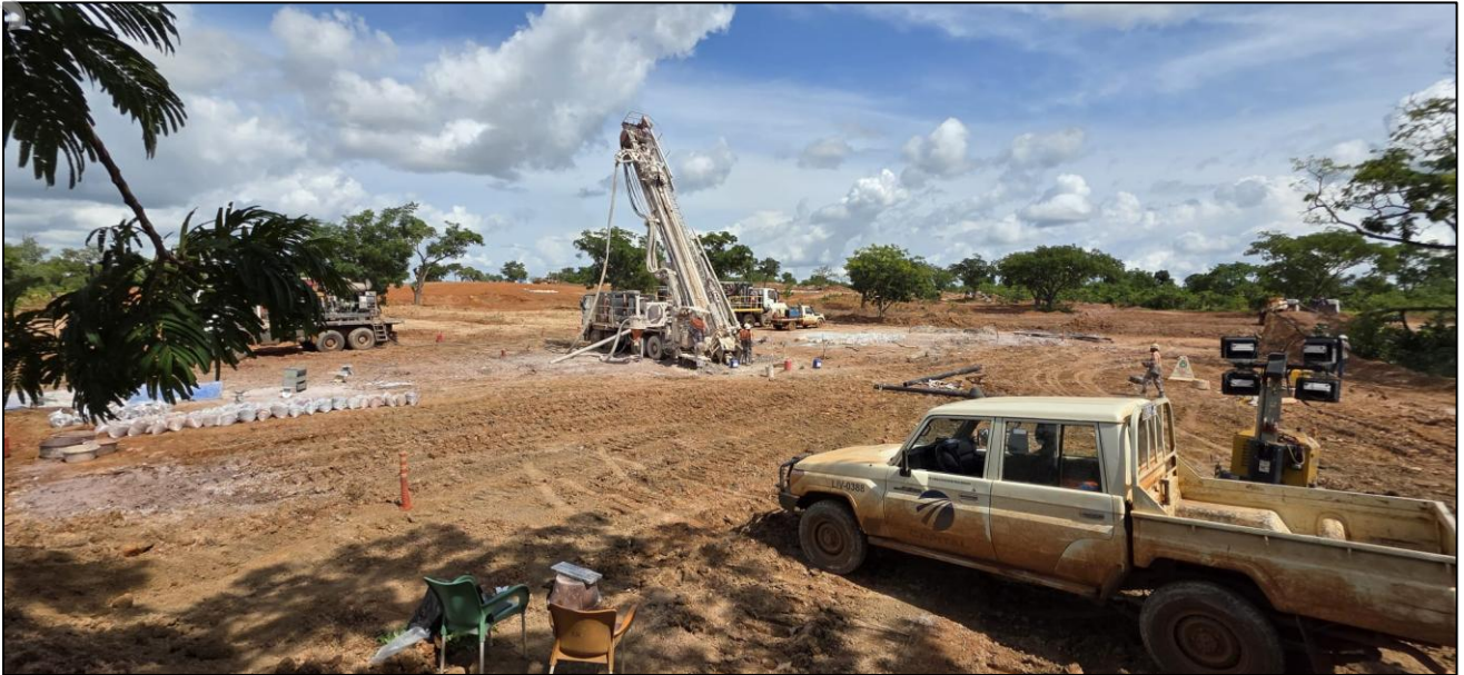
Figure 5: The 2025 drilling campaign at Massan commenced late in the June quarter, starting with a planned 11,500 m of RC drilling.

the regional geochemical dataset. Phase 1 soil sampling consists of 519 points on a 100 x 100 m spaced grid.