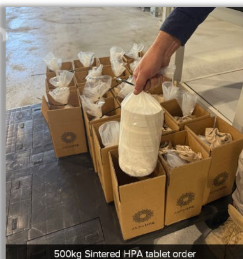
500kg Sintered HPA tablet order

Product sales continue to build from the Stage 1 PPF, with AUD$114K in sales completed in the quarter and a further USD$194K in orders in place (see tables below).