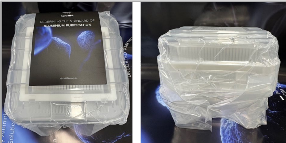
Cassette of completed 8" (200mm) sapphire wafers for GaN-on-sapphire semiconductor end-user (RHS)