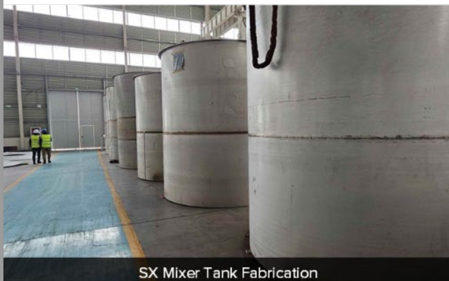
SX Mixer Tank Fabrication