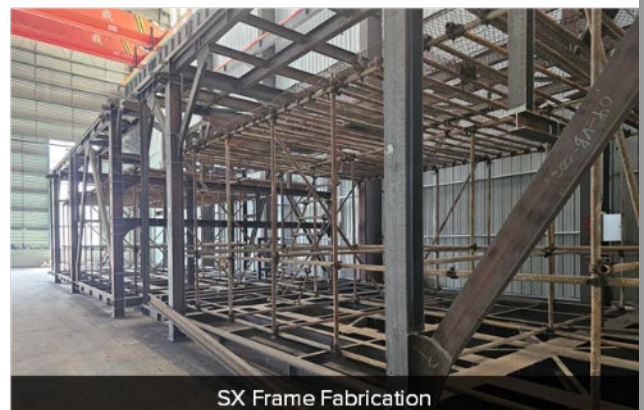
SX Frame Fabrication