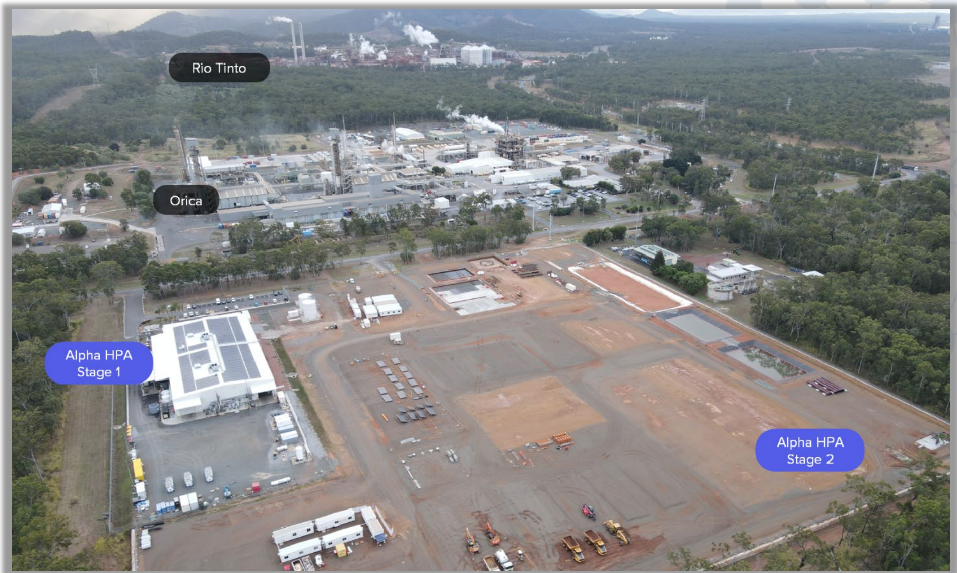
HPA First Project site looking west, showing completed earthworks and commencement of civil works Orica Yarwun in midground and Rio Tinto Yarwun alumina in background