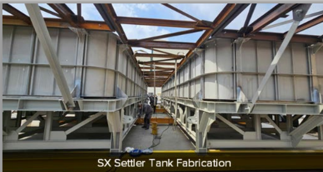
SX Settler Tank Fabrication

Project procurement has continued to advance with the steady issuance of the remaining plant equipment orders.