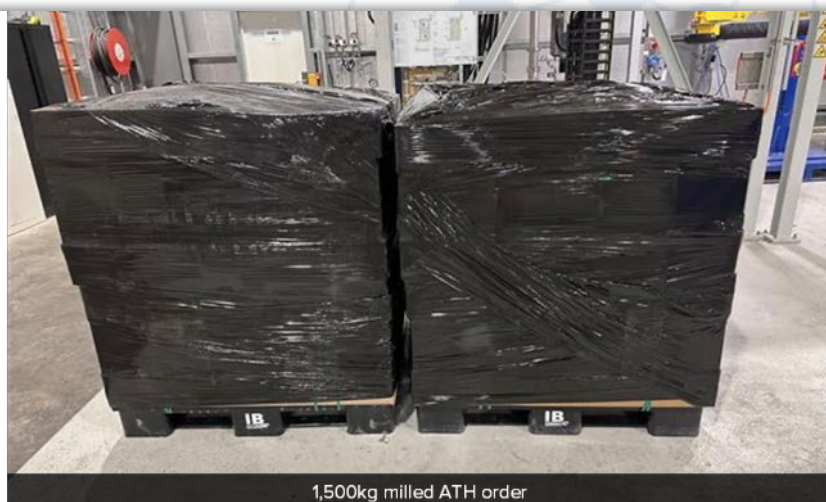
1,500kg milled ATH order

Selected product sales orders delivered during the quarter