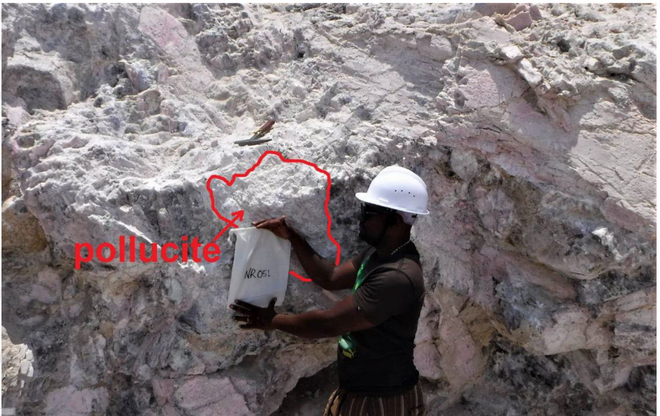
Figure 11. Interstitial pollucite pod amongst spodumene megacrysts in a trench at the Muvero Prospect 3 .

Since acquiring the Project, Tyranna has completed 50 reverse circulation drill holes and 20 diamond core holes.