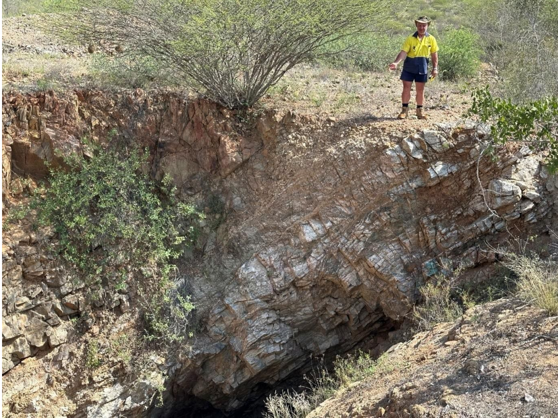
Figure 5: Detailed view of the thick laminated quartz vein in shear zone (Maongo group); see figure 4.