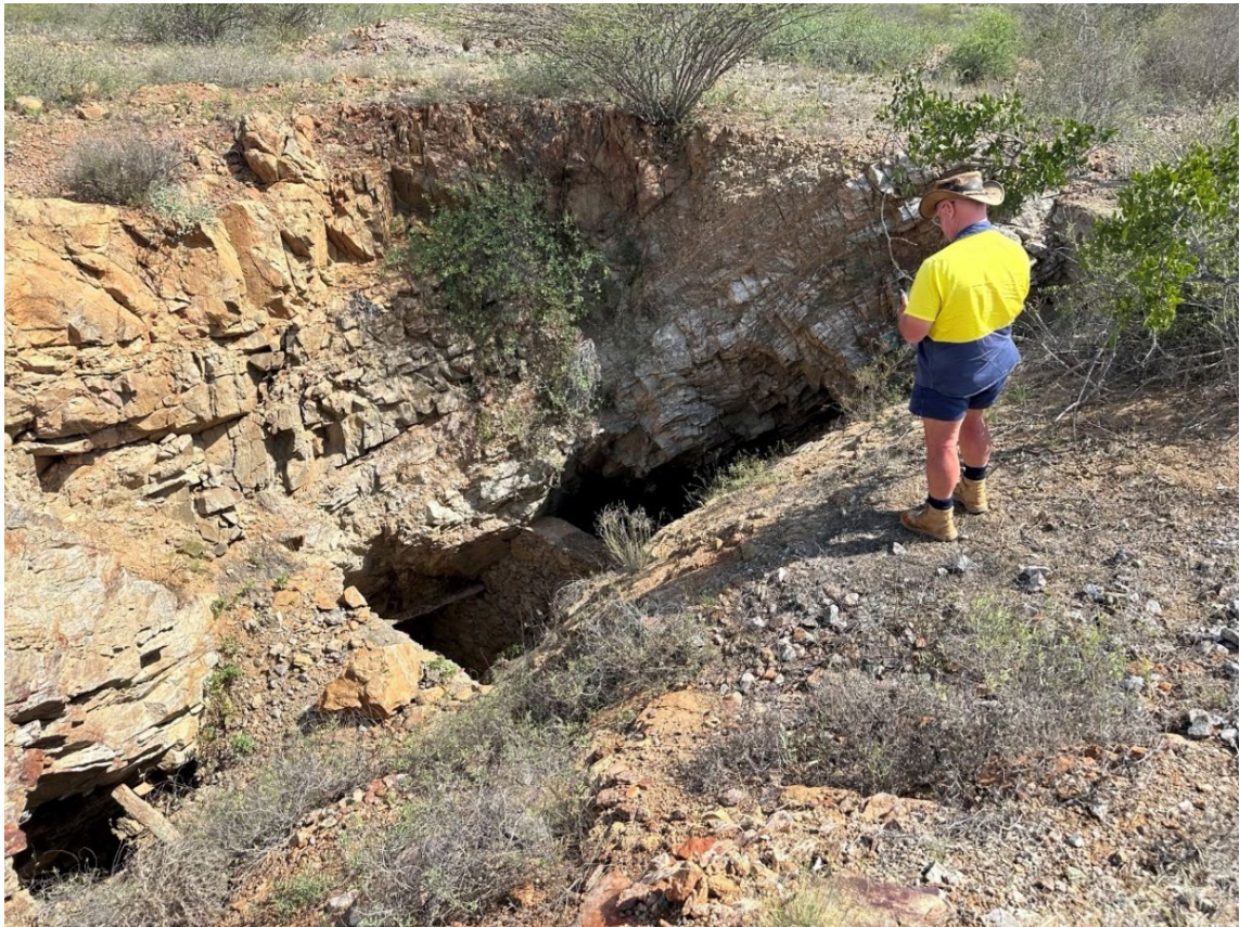
Figure 4: View south of a well-constructed historical mine; Maongo group.