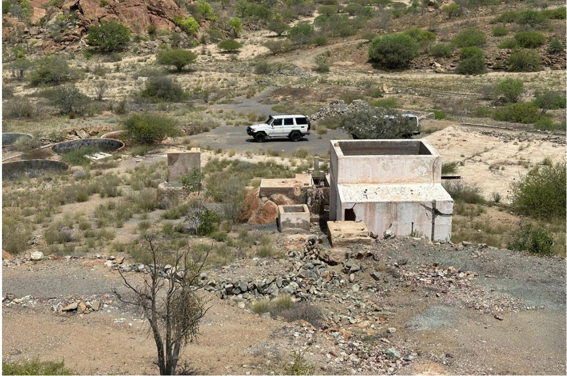
Figure 3: View westwards across remnants of the historical Maongo Ore Treatment Plant.