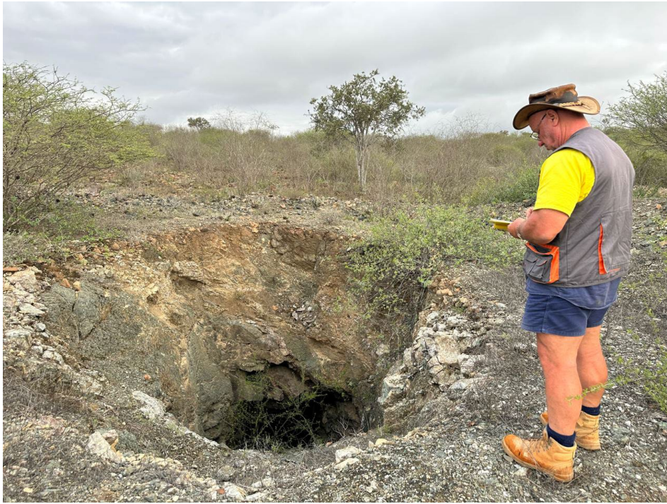
Figure 9: View east across shaft, 170m south of mine in Figure 8 (Conango Canpungo workings).