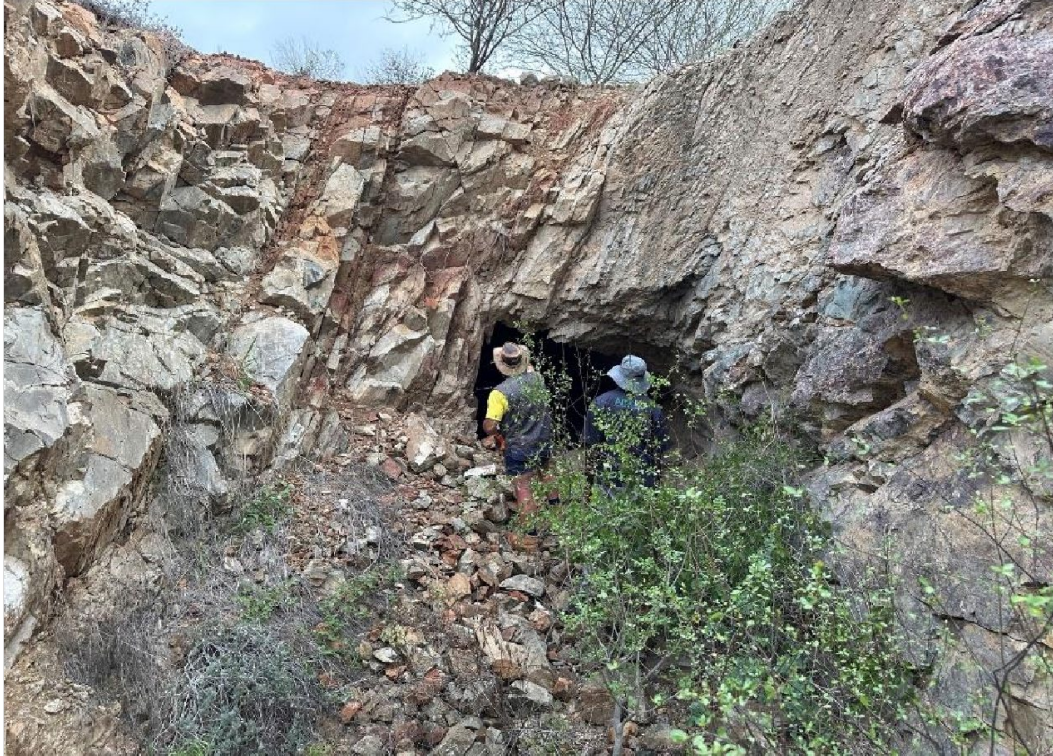
Figure 7: View south into Conango Compungo group adit at workings 800m south southeast of mine in Figure 6.