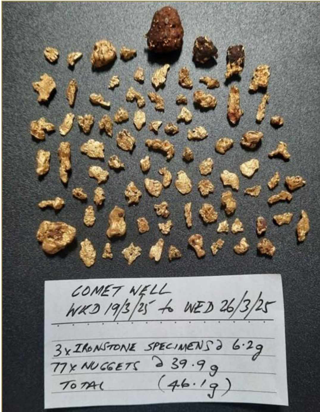
Figure 2: Picture of recently reported nuggets discovered at Comet Well.

A third party prospecting group recently reported the discovery of more nuggets in the Comet Well area to the Company, consisting of 3 ironstone specimens weighing 6.2 grams and 77 nuggets weighing 39.9 grams, totalling 46.1 grams. The Company has reviewed their reported locations, and accordingly updated several focused drill targets for future drill testing (see Figure 3 , overleaf). Drill assays from the recent aircore drilling (17 holes for 406m) is hoped to provide more assistance in locating the primary source(s) of gold mineralisation at Comet Well.