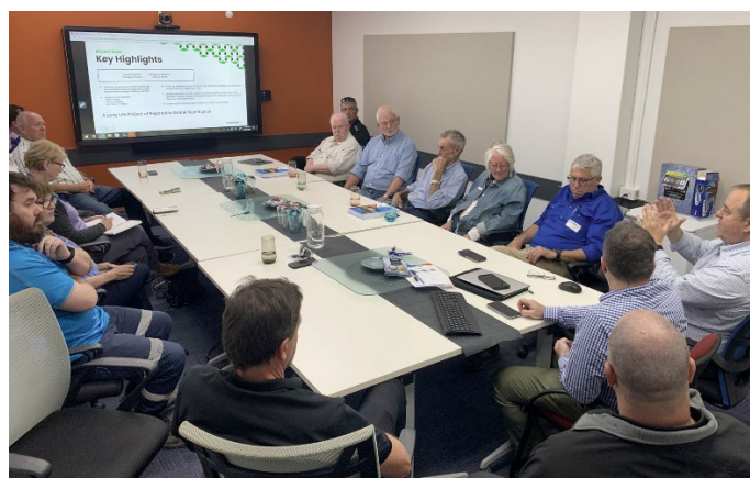
Figure 2: Project update with the Broken Hill City Council