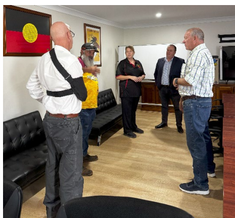
Figure 1: Board meeting with the Broken Hill Local Aboriginal Land Council