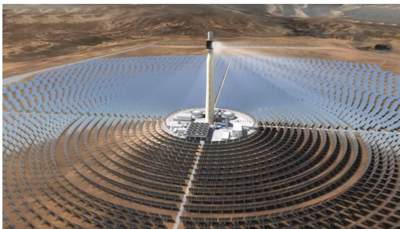
Figure 3: Noor-Concentrated Solar Power ("CSP") plant.

To support commercial scalability, refining of the hydrophobic formulation and application processes continued, with the goal of accelerating deployment across large-scale solar installations. Pending successful outcomes from current field trials, Nanoveu anticipates the potential conversion of these test programs into high-volume commercial orders.