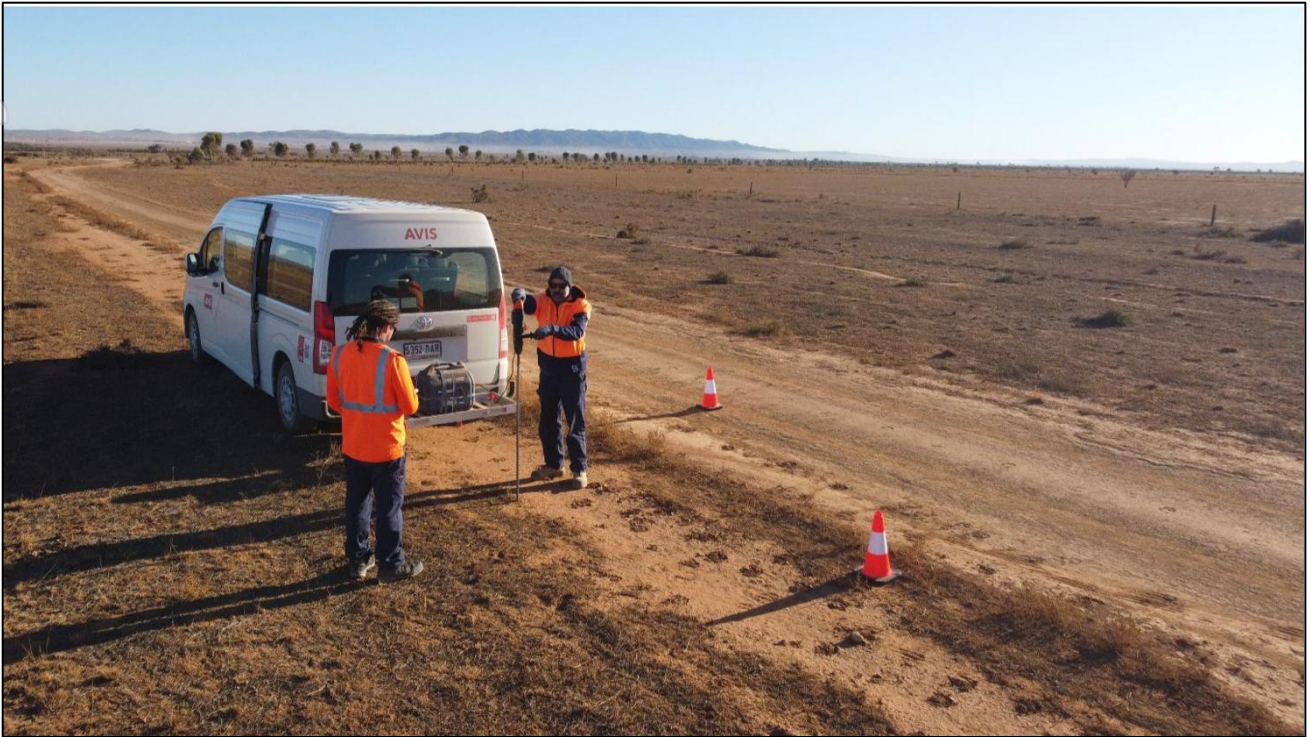
Figure 1: Field operations in the southern flinders area, collecting soil air geochemical analysis at Project HY-Range, May 2025.

The excellent results of the geochemical sampling programme were announced post period on 7 July, “ Outstanding Geochemical Results at HY-Range Project ”. Analysis of the data yielded very positive results, with a high percentage of elevated hydrogen values in numerous areas of the licence, locally exceeding 1,000ppm in several locations, and up to 3,000ppm at one sample point (compared to typical background atmospheric values of 0.5ppm). Locally elevated helium readings were also recorded up to 27ppm (compared to typical background atmospheric values of 5ppm). Whilst soil gas sampling can be inherently prone to anthropogenic hydrogen contamination and sample bias, the distribution of the values strongly correlates with mapped geological features and supports the natural origin of these highly elevated readings, as shown in Figure 2a and 2b . The detection of elevated helium is unambiguous and demonstrates a working helium system.