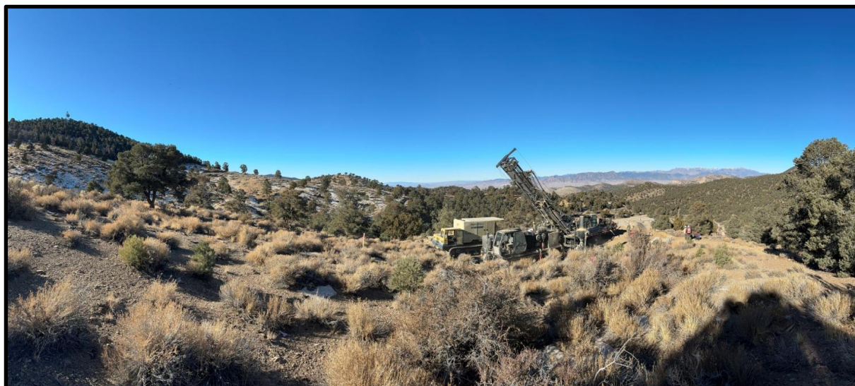
IMAGE: Drilling at White Caps Project, February 2025

During the March quarter G50 executed a maiden RC drilling program designed to test near surface portions of the Cambrian Gold Hill - White Caps stratigraphic unit. The program is the first at White Caps since Freeport McMoRan drilled the property in the 1980's (refer above image). 12 RC holes were completed for a total of 1,386 m.