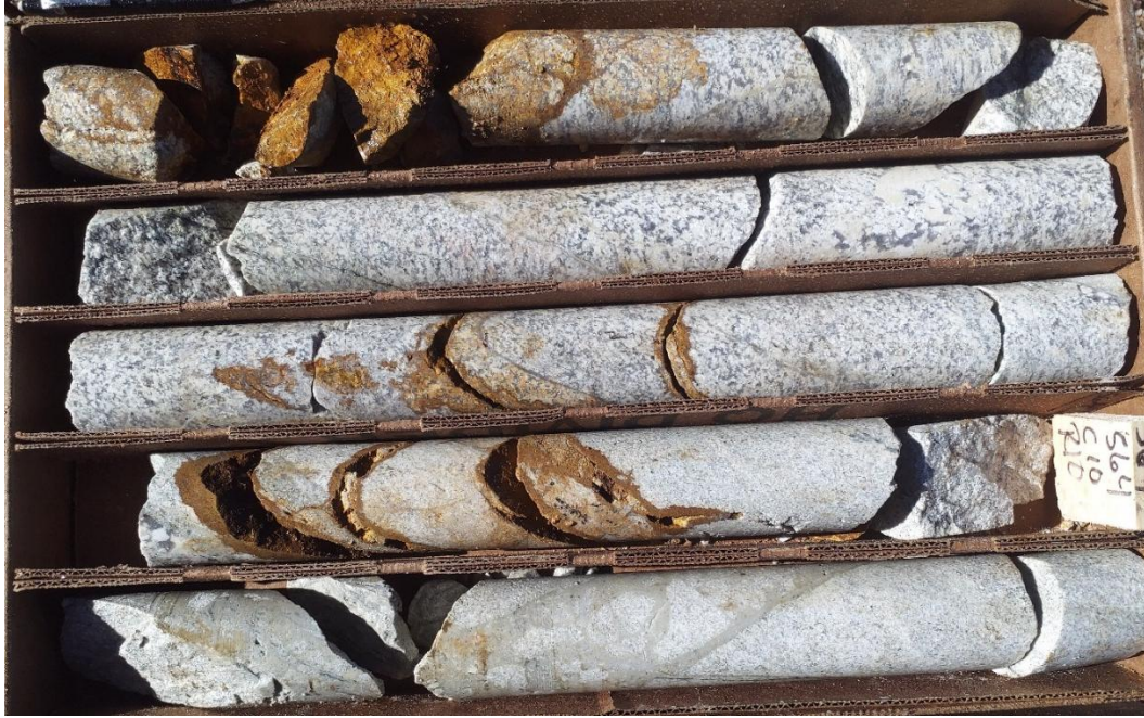
FIGURE 2: Argillic altered and veined (qtz-sulphide) granite from drill hole GDD02 where samples were taken for mineralogical study. The rock is composed of quartz (56%), k-feldspar (26%), muscovite (7%) and kaolinite (5%).