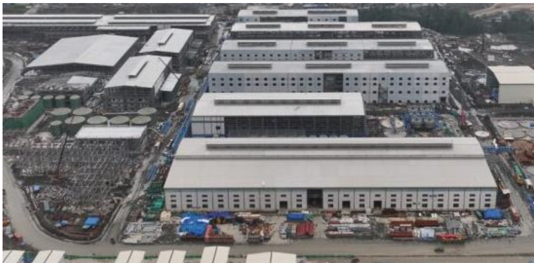
ENC integrated refinery construction progress