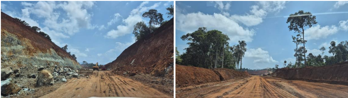
Sampala haul road construction