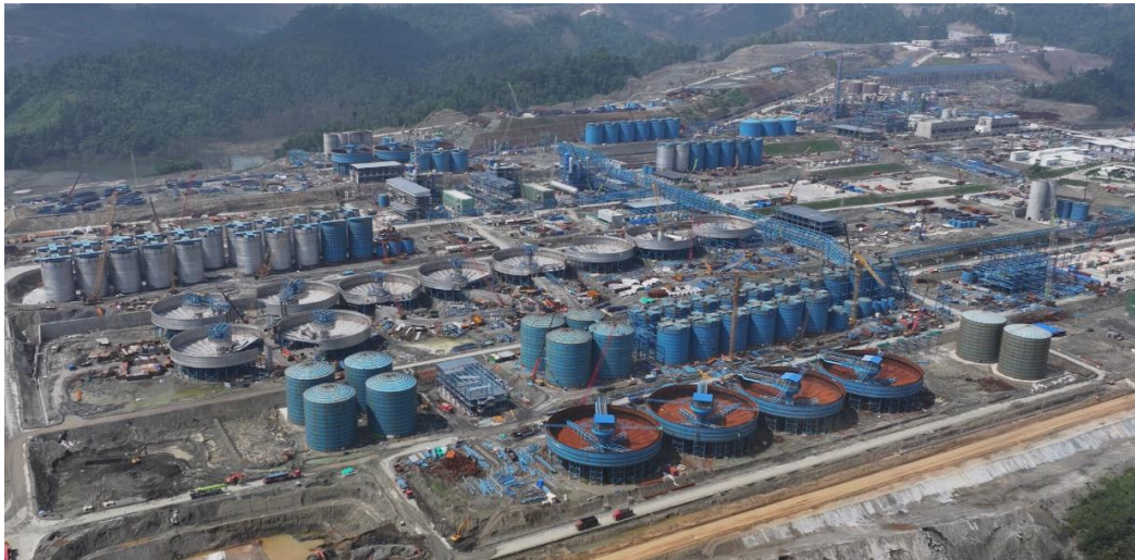
ENC HPAL smelter construction progress

During the quarter, all major equipment at the HPAL smelter was mounted, including the final Autoclave (3/3), enabling the connection of major process equipment via pipe racks and bridges. Feed preparation, autoclaves, CCD, reactors, thickeners and product packaging plants are all proceeding well. Sulphur incineration and power plant erection continued, with the power infrastructure now well underway throughout the facility. The integrated refinery has reached a point at which staged commissioning could commence. However, due to the working capital that would be required to commence commissioning of the refinery and stockpiling of end product until ENC's IUI issuance, the Company has taken the decision to focus on the completion of the ENC HPAL smelter and sulphate circuit. The Company expects the IUI to be issued early in Q1 of 2026, which aligns with the original schedule.