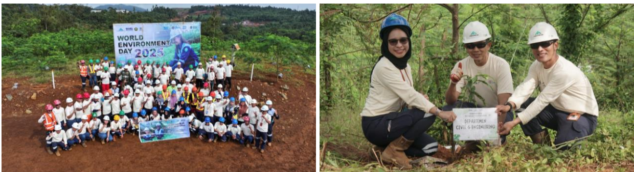
World Environment Day 2025

During the quarter, the Company continued to advance approval of its feasibility study which will target a production license of 3 million wmt of ore per annum. Surface sampling commenced on a new exploration area of approximately 1,200 hectares to the northwest of the current IUP, with 43 kms of ground penetrating radar surveying planned to be completed in the second half of 2025.