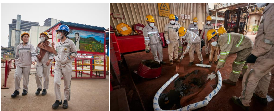
RKEF operations training

Further RKEF detail is contained in Appendix A.