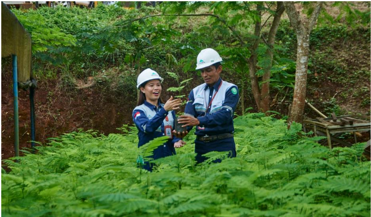
2024 Sustainability Report

Among the report's key disclosures is the formal establishment of the Nickel Industries Foundation, to lead the Company's strategic programs on education, health, environmental conservation, and economic empowerment. The foundation is designed to scale impact across the Company's operating regions and embed social responsibility more deeply into the business. The report also celebrates the maiden intake of university scholarship recipients, marking the first cohort of students supported under the Company's expanded commitment to higher education access. This initiative strengthens human capital development and opens new opportunities for youth in local communities. Another milestone is the approval by the Central Sulawesi Natural Resources Conservation Agency for the development of a conservation and biodiversity area within the Hengjaya Mine concession. This effort affirms the Company's leadership in integrating biodiversity protection into mine planning and contributes to Indonesia's broader conservation goals.