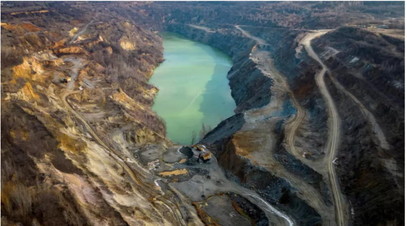
Figure 3 : Aerial view of Volt's 70% owned Zavalievsky Graphite mine

Operating since 1934, Zavalievsky Graphite is a proven supplier with a long history of serving European and Asian customers. The mine's strategic location and robust infrastructure enable reliable delivery to customers, while Volt's 70% ownership provides opportunities for future productivity improvements and continued community support.