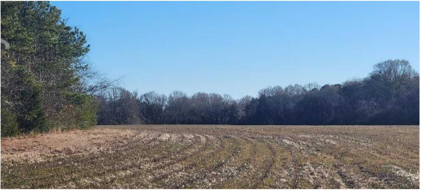
Figure 2: Tuscaloosa County Airport Industrial Park Greenfield Site