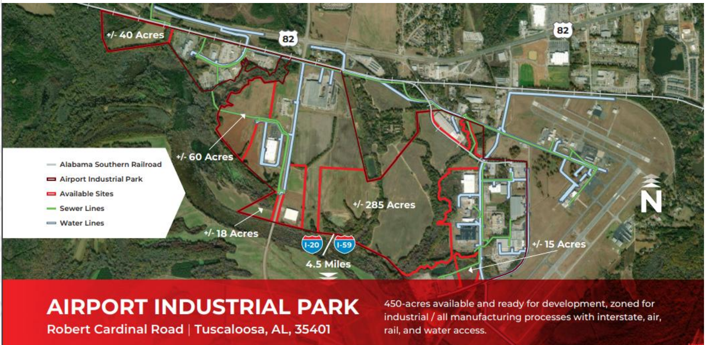
Figure 1: Potential Site - 1,000-acre Airport Industrial Park Site Map