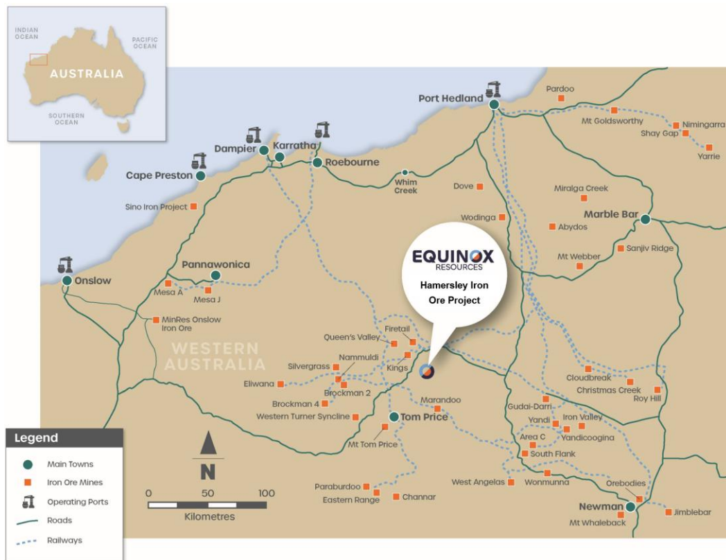
Figure 1: Strategically Located: Equinox Resources' Hamersley Iron Ore Project at the Heart of Western Australia's Mining Hubs

The Hamersley Iron Ore Project contains a current Direct Shipping Ore (“DSO”) Inferred Mineral Resource of 108.5 million tonnes at 58 % Fe within its broader resource and represents a significant opportunity for regional economic development and employment in Western Australia.