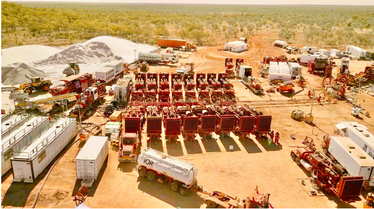
Hydraulic stimulation pump equipment being set up at the Carpentaria-5H well pad