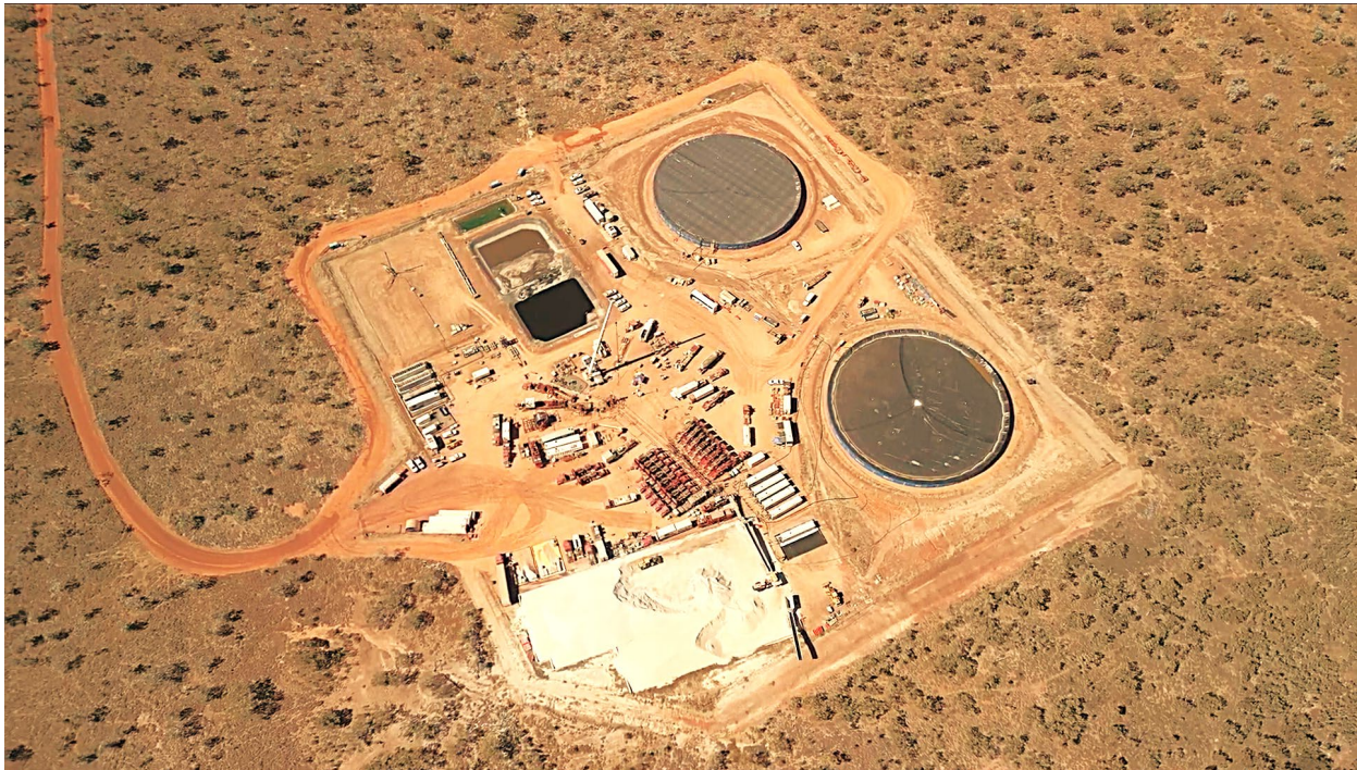
Aerial view of mobilisation during the Carpentaria-5H hydraulic stimulation operation

This IP30 test is a precursor to the longer term planned pilot production following the commissioning of the Carpentaria Gas Plant. C-5H will form part of the Carpentaria Pilot Project along with C-2H and C-3H.