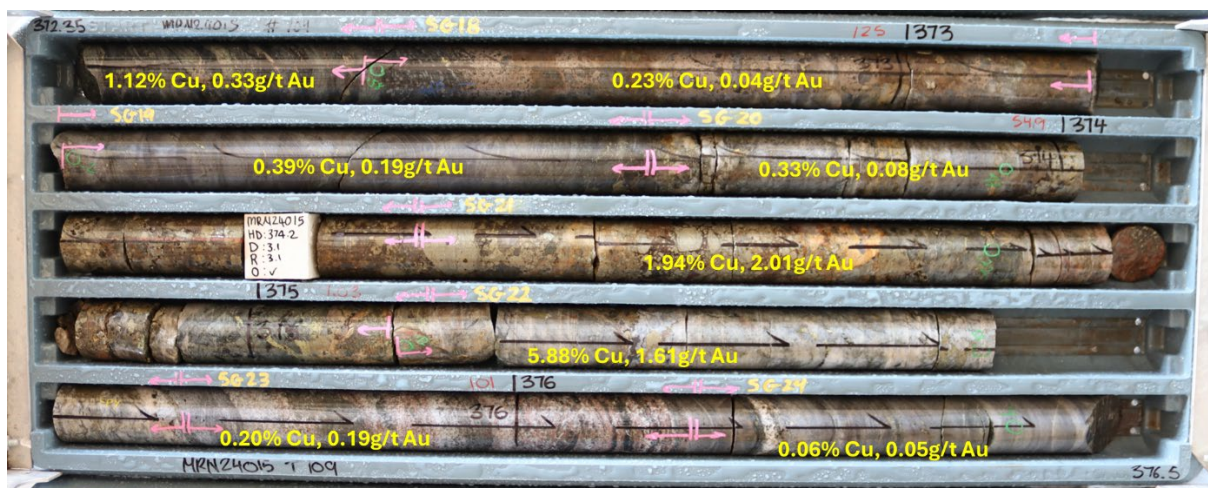
[Figure 2b]. Drill Core Photo of MRN24015 (Previously Released to ASX:MMA 9/4/2025) showing fresh "Primary" copper-gold mineralisation from within the Starter Zone