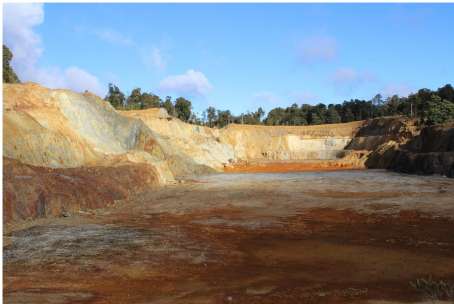
Figure 8 Que River open pit

For complete JORC disclosures please refer to ASX Announcement dated 25 March 2025 'Greenwing tables updated Polymetallic Mineral Resource at Que River'