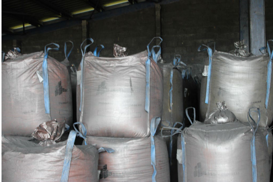
Figure 5 Graphite concentrates in warehouse store