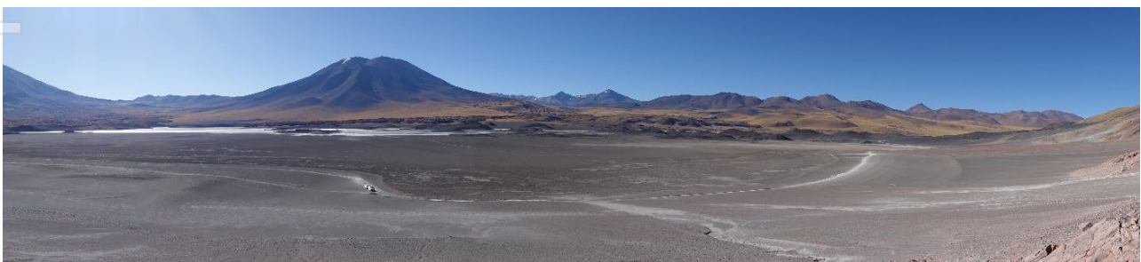
Figure 1 – San Francisco Salar looking west.

These results from two leading providers of DLE processing technologies, IBC and Xtralit 2 , in addition to other test work completed, confirm that the San Jorge Brine is highly amenable to DLE processing.