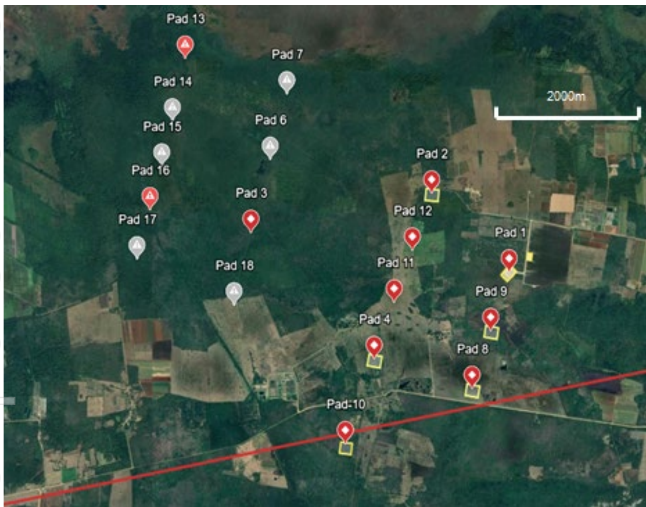
Figure 1 – Production pad locations for the initial field development plan

Amistad-2 is to be drilled from Pad 9 (see Figure 1) in a southerly direction along the existing 2D seismic line and is designed to intersect the entire Unit 1B (Veloz Group, Amistad-sheet) reservoir in a favourable location for numerous interpreted fracture sets. The location is approximately 800 metres from and 200 metres updip of the successful Alameda-2 well.