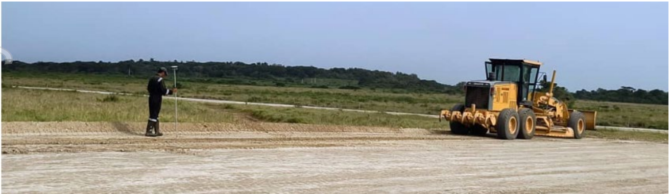
Figure 2 – Construction of pad for Amistad-3 nearing completion during the reporting period.

The Amistad-3 production well targets several interpreted fracture sets within the Unit 1B (Veloz Group, Amistad-sheet) oil reservoir. A total depth of 1625 metres MD is programmed, and aiming to be up dip to the lowest known oil in this unit (see Figure 3). Amistad-3 is planned to immediately follow Amistad-2.