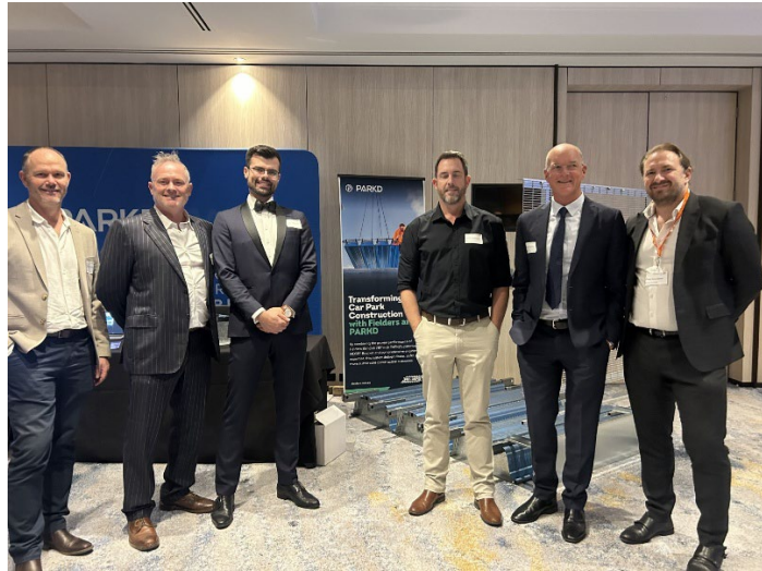
Image 2. Delta Corp, Fielders and PARKD together at CIA Trade Show