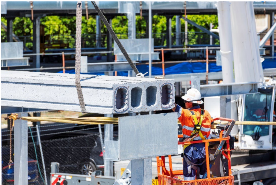
Image 3. Installation of CVB

PARKD has entered into a national supply agreement with Delta Corporation, a leading precast supplier based in Western Australia. This agreement facilitates PARKD's objective to pursue nationwide opportunities arising from Fielders' market introduction of the MDSB x SlimDek 210® system. The partnership with Delta allows supply chain efficiencies and bolsters the scalability of PARKD's modular solutions across diverse Australian construction markets.