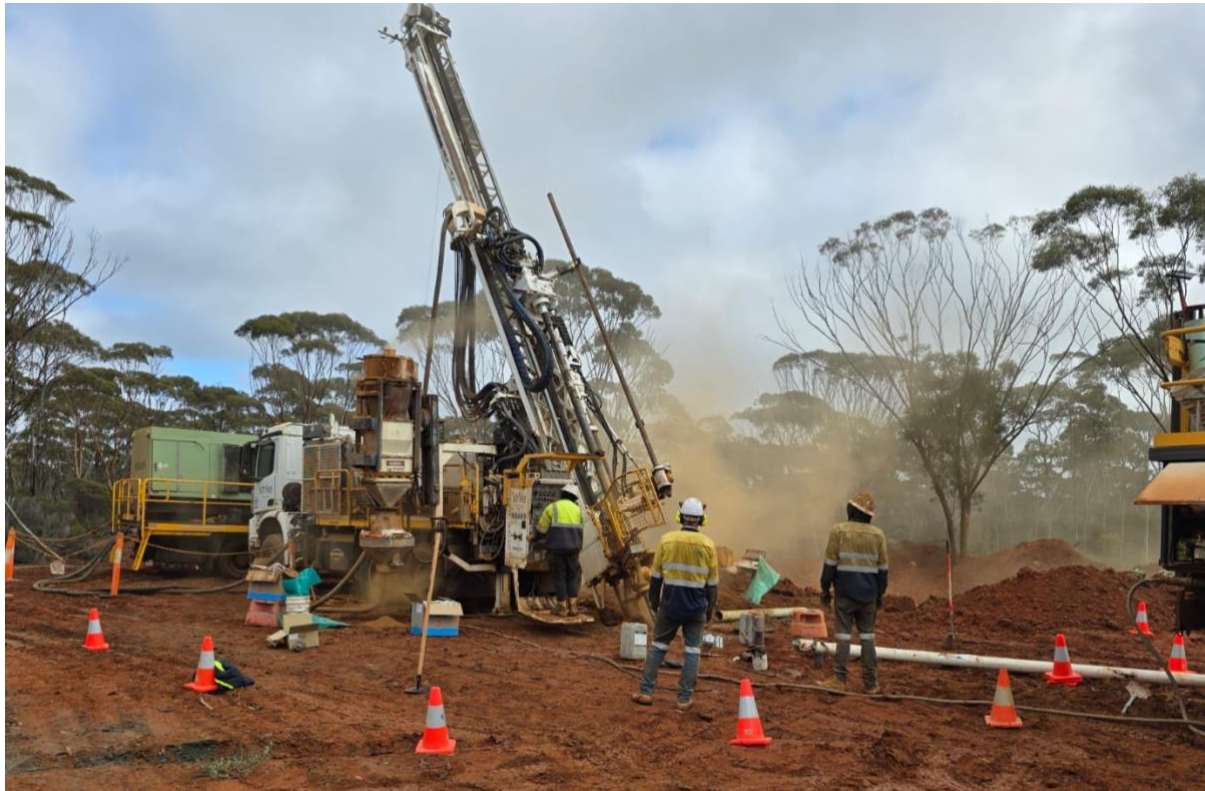
Figure 1: Photograph of RC rig at first hole of Phase 1 drilling programme at DFN