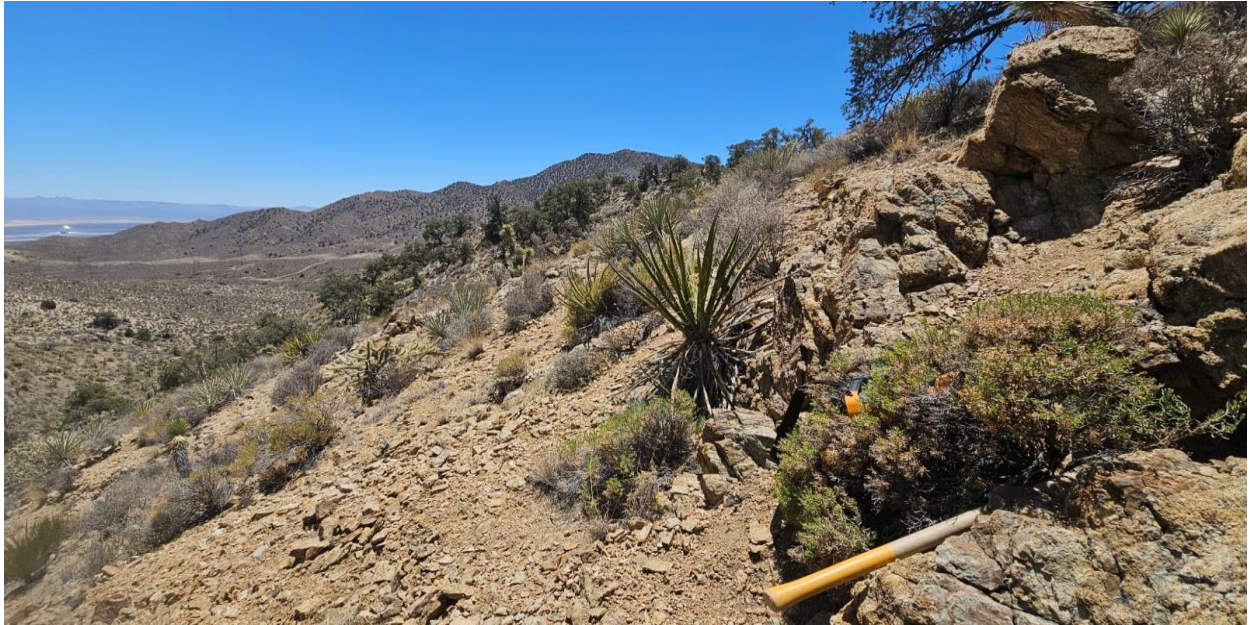
Figure 2 – Desert Star North aerial photo looking Southeasterly