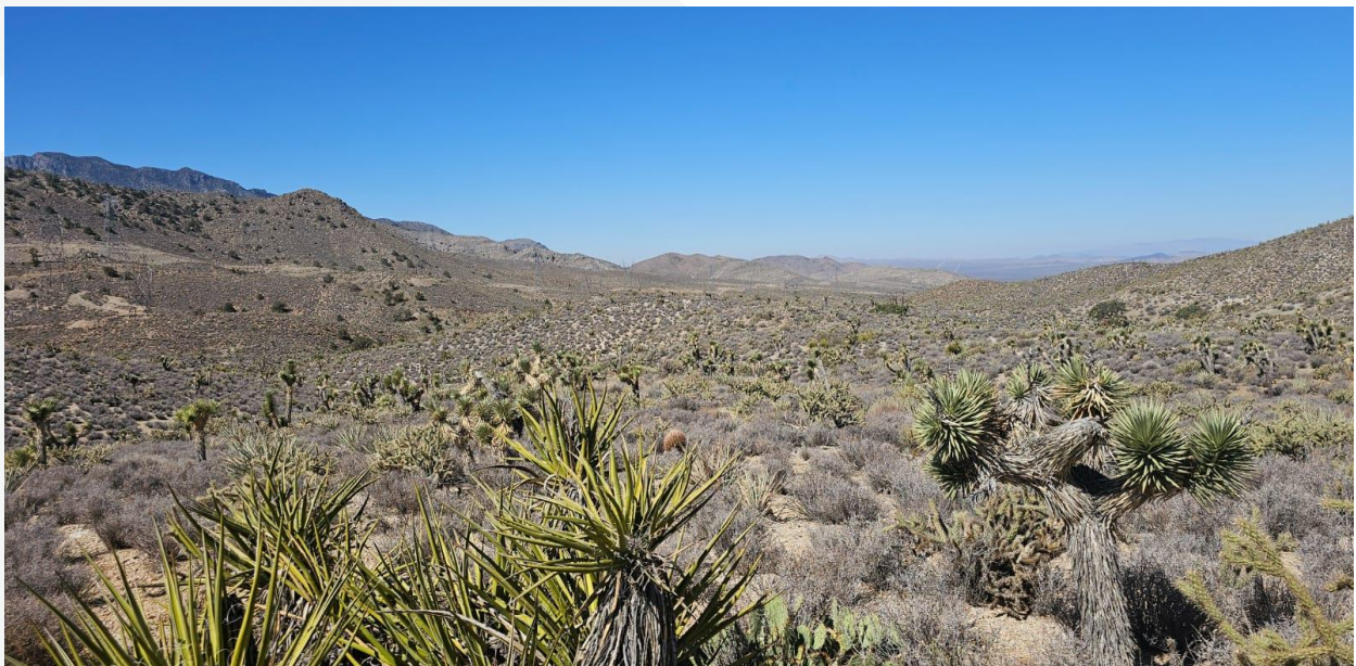
Figure 1 – Aerial photo looking north-westerly toward outcropping metamorphic and felsic plutonic rocks at the Desert Star Project

This integrated dataset provides complete geophysical coverage over the project area, offering an excellent foundation for refining structural interpretation, assessing geological similarities to nearby deposits, and guiding cost-effective follow up exploration work plan.