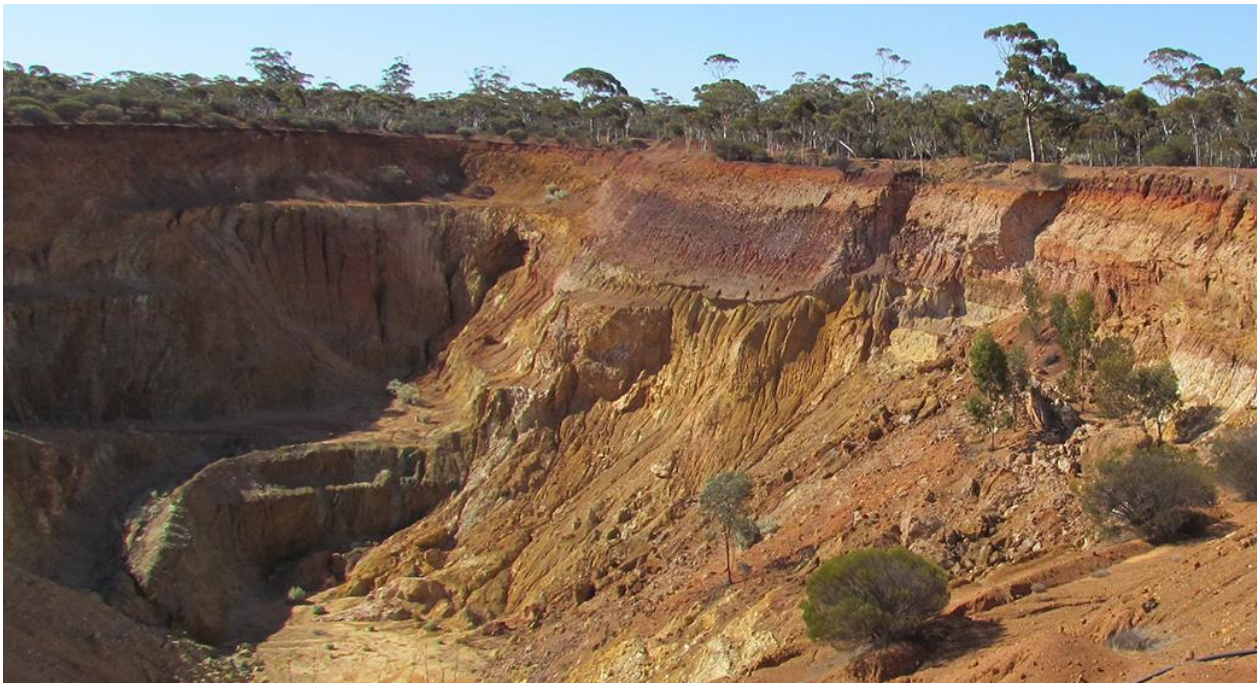
Mt Dimer Taipan pit, view to northwest