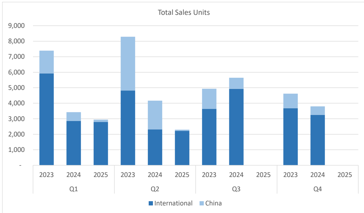
Photo: For year 2025, currently only have 1Q25 and 2Q25 units.

The chart below illustrates the Company's historic international unit sales, by quarter, for the current and previous financial periods: