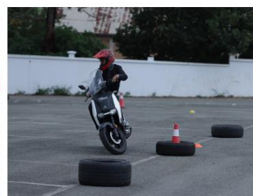
Photo: Vmoto's Madagascar distributor exhibited Vmoto's electric two-wheel products in exhibitions and increase Vmoto's brand exposure

Vmoto Limited Level 39, 152-158 St Georges Terrace, Perth, Western Australia 6000, Australia ABN: 36 098 455 460 ASX: VMT Phone: +61 8 6311 9160 Email: info@vmoto.com