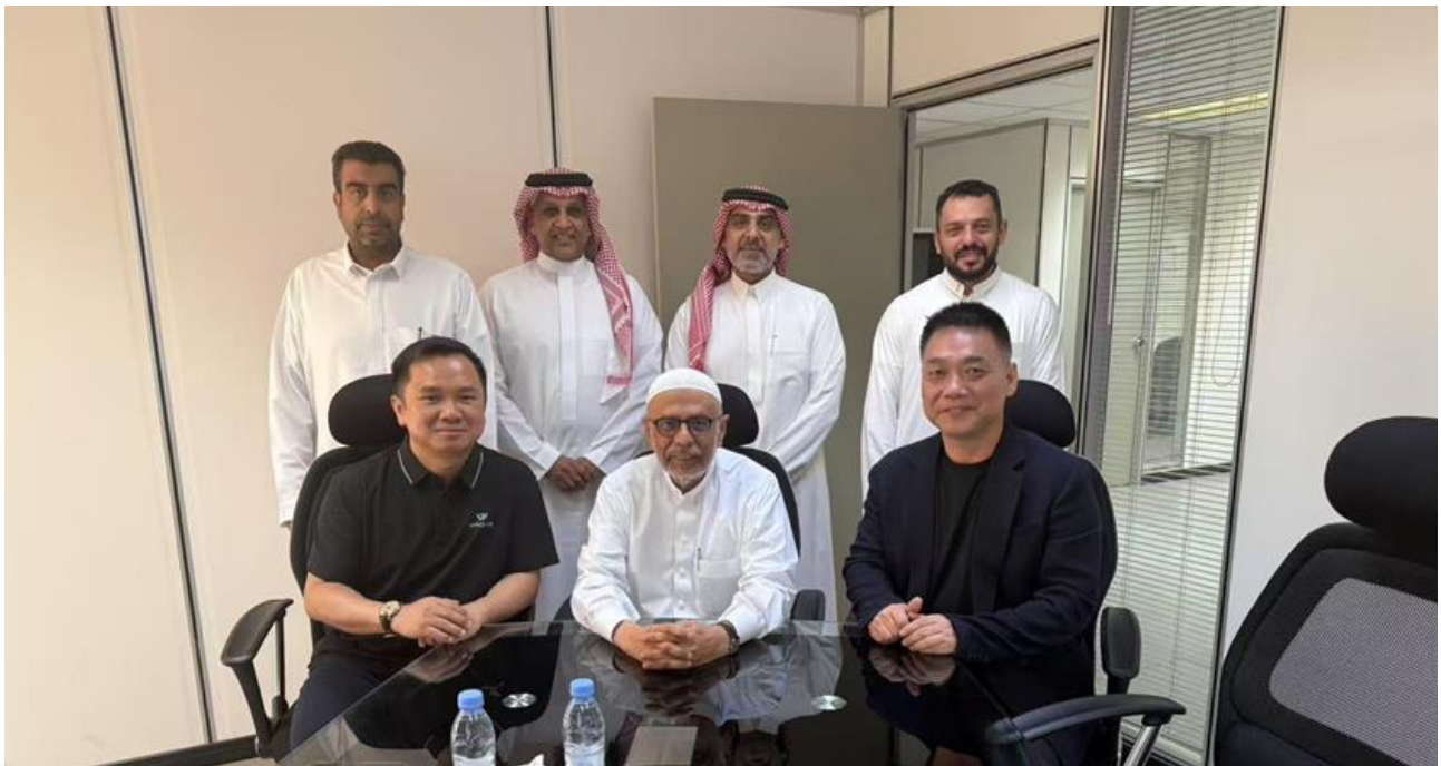
Photo: Vmoto signed up with new customer from Saudi Arabia and conducts site visits to Saudi Arabia to understand local market.