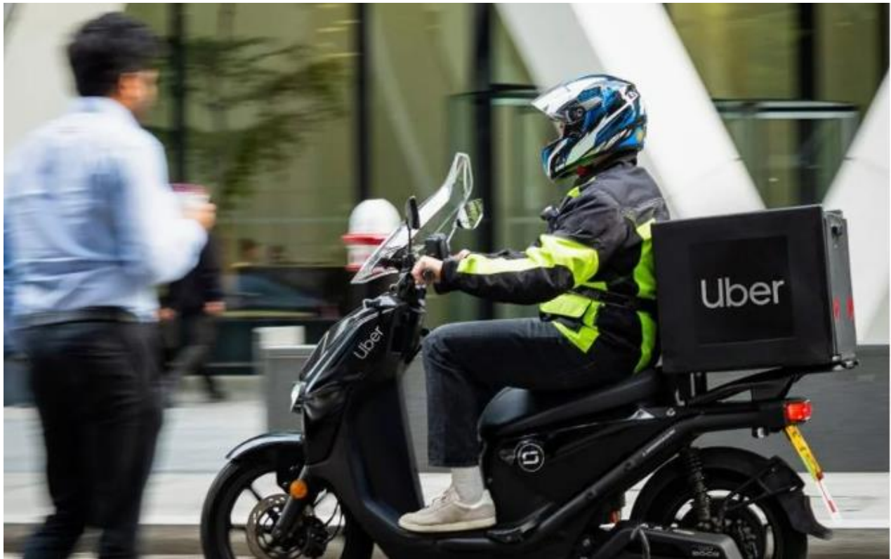
Photo: Vmoto's electric moped in use by Uber riders for food delivery in UK

Discounted e-mopeds will be available to Uber Partners and couriers in Amsterdam, Berlin, Brussels, Lisbon, London, Madrid, and Paris.