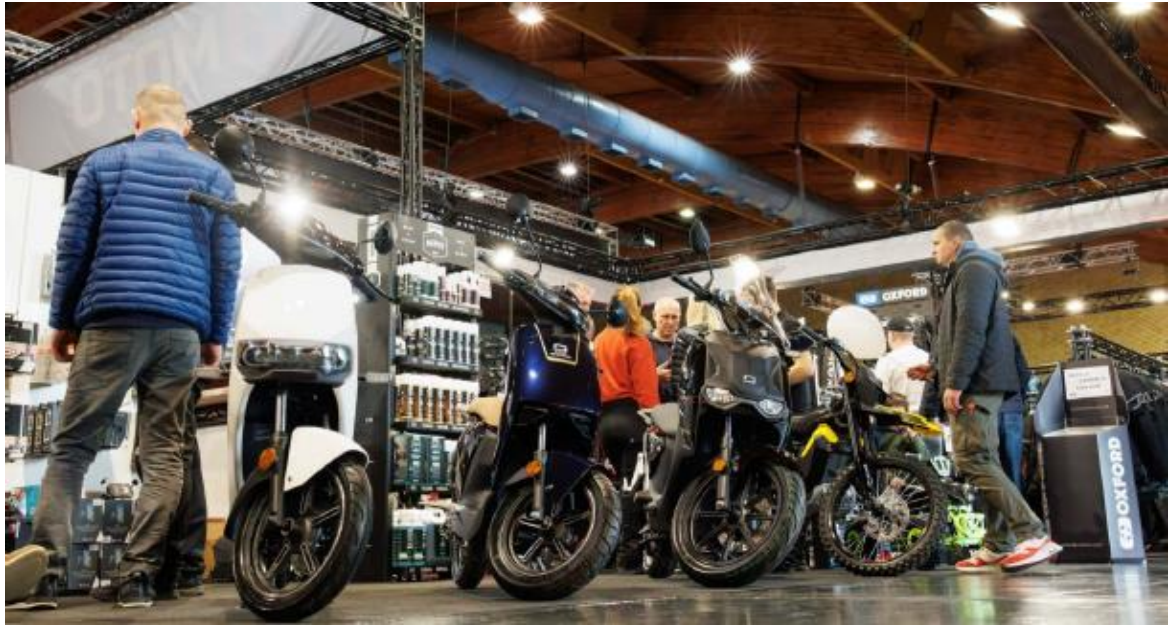
Photo: Vmoto's Latvia distributor exhibited Vmoto's electric two-wheel products in Outdoor Riga 2025 exhibition in April 2025

In 2Q25, Vmoto and its distributors showcased their extensive range of electric motorcycles/scooters and swap and charging stations at various international motorcycle exhibitions and events.