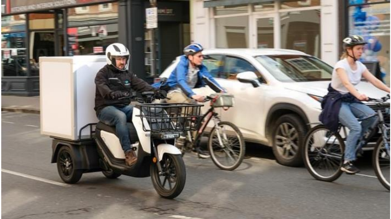
Photo: Vmoto electric 3-wheel vehicle, VS3, performing heavy duty delivery.

For the longer-term outlook, the trend towards EV products globally remains positive, where government policy is facilitating the continued electrification of the transport industry at large, including Vmoto's markets.