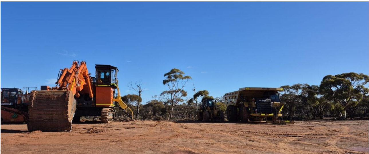
Photo 1: Mobilisation of mining equipment for Fingals is underway.