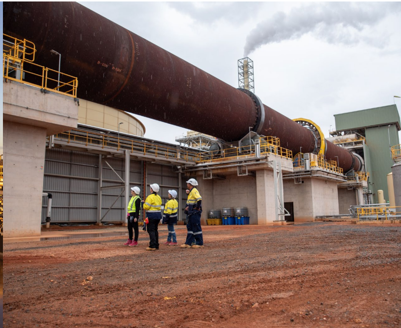
New Kalgoorlie Rare Earths Processing Facility