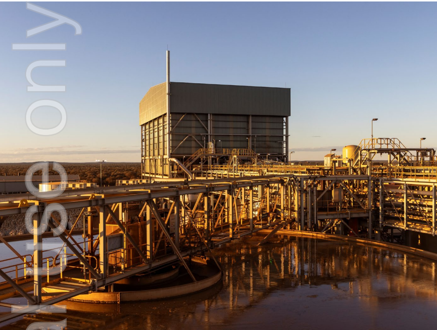
Mt Weld Expansion