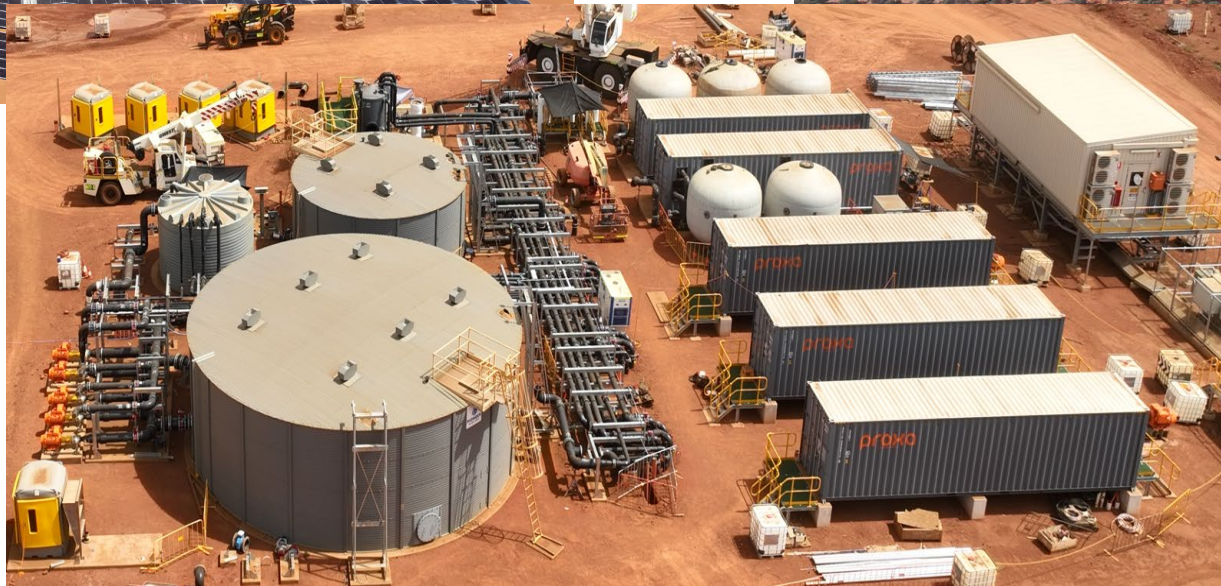
Bore Water Treatment Plant and Recycled Water Treatment Plant installed