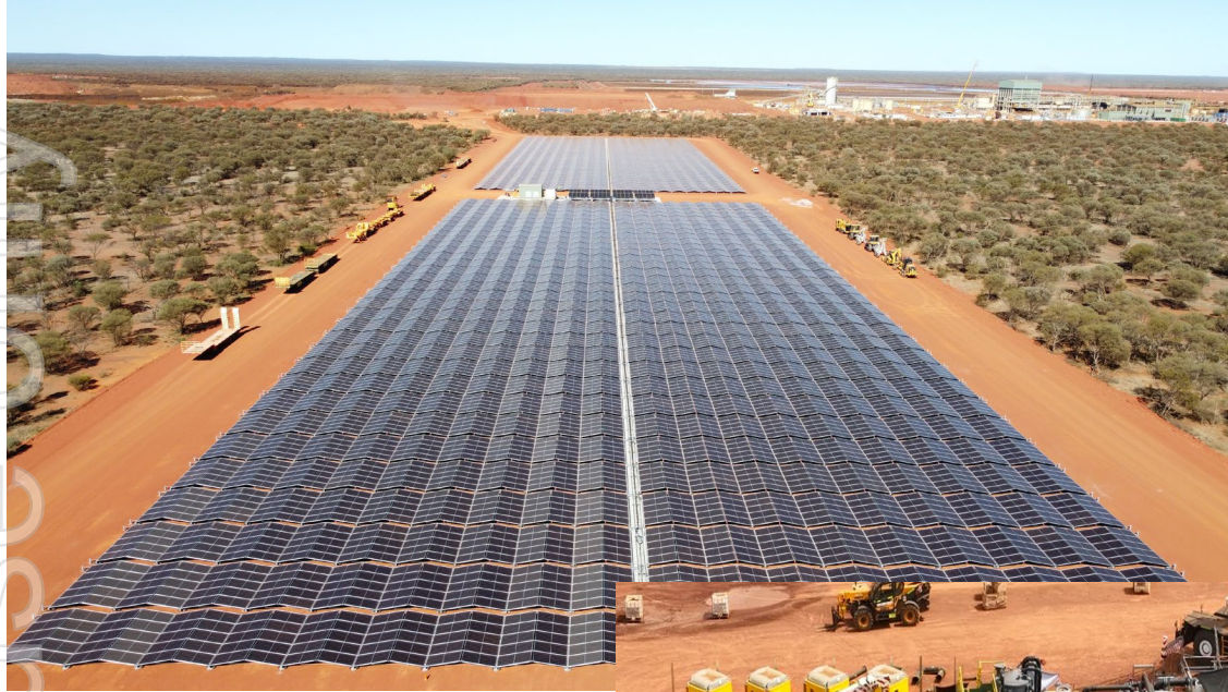
Solar farm - construction complete and operating (With our power purchase agreement (PPA) partner, Zenith Energy)