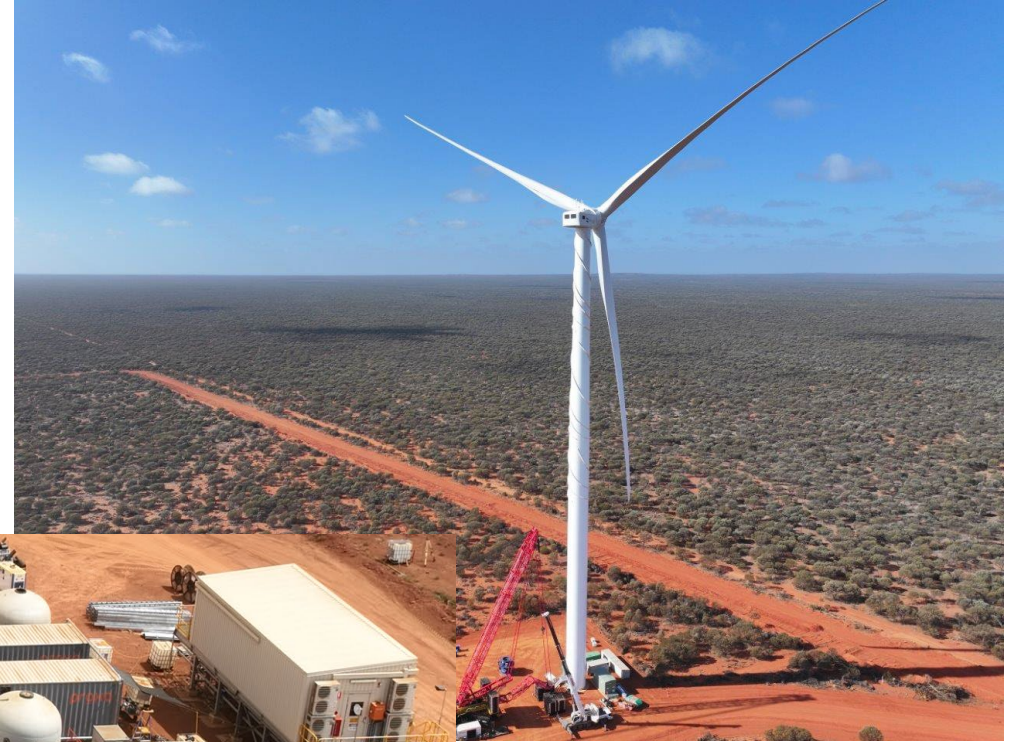
Wind farm - 2 of 4 wind turbines now installed (With our power purchase agreement (PPA) partner, Zenith Energy)