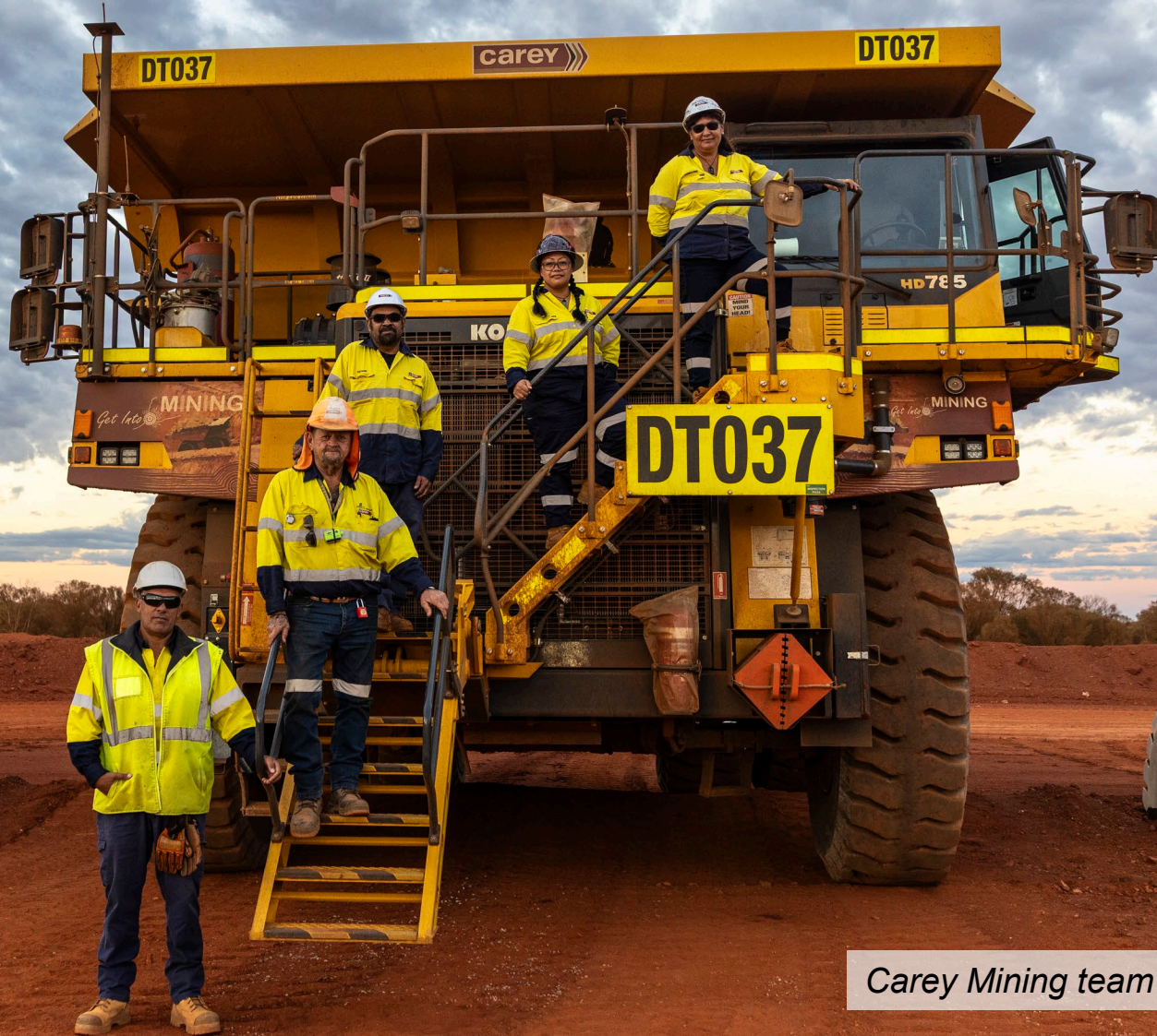
Carey Mining team onsite at Mt Weld

74% of suppliers to Australian operations are WA headquartered companies