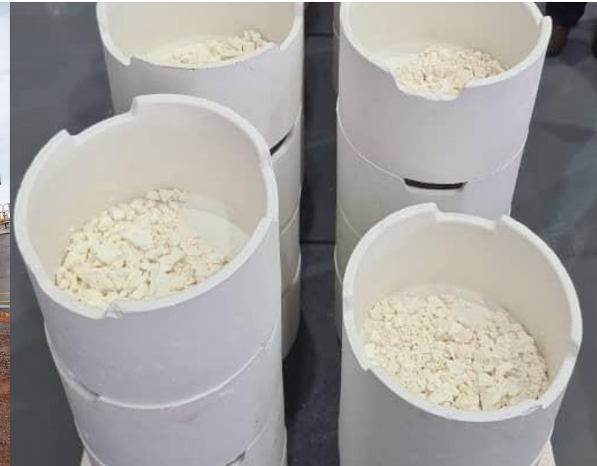
Kuantan Facility Expansion

Over A$1.5 billion invested in expansion capital in past 5 years