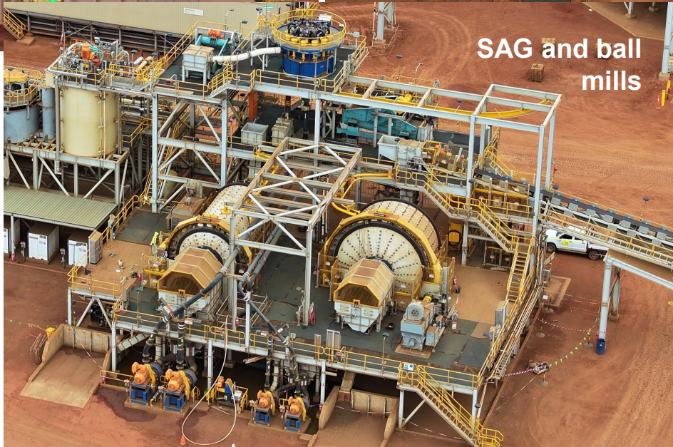
SAG and ball mills