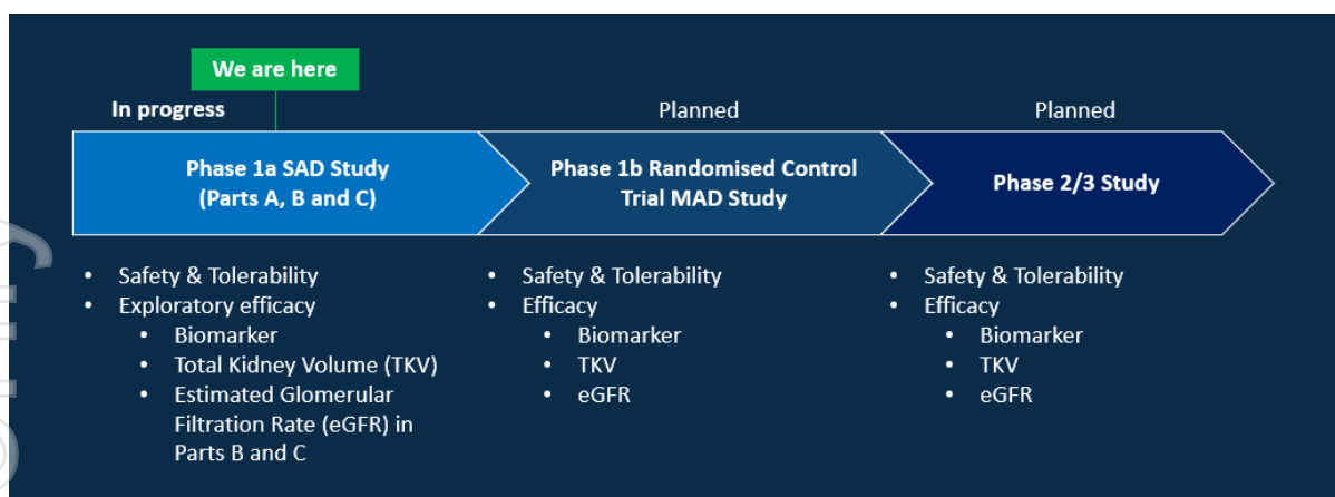
Figure 3. Proposed clinical development pathway for PYC-003