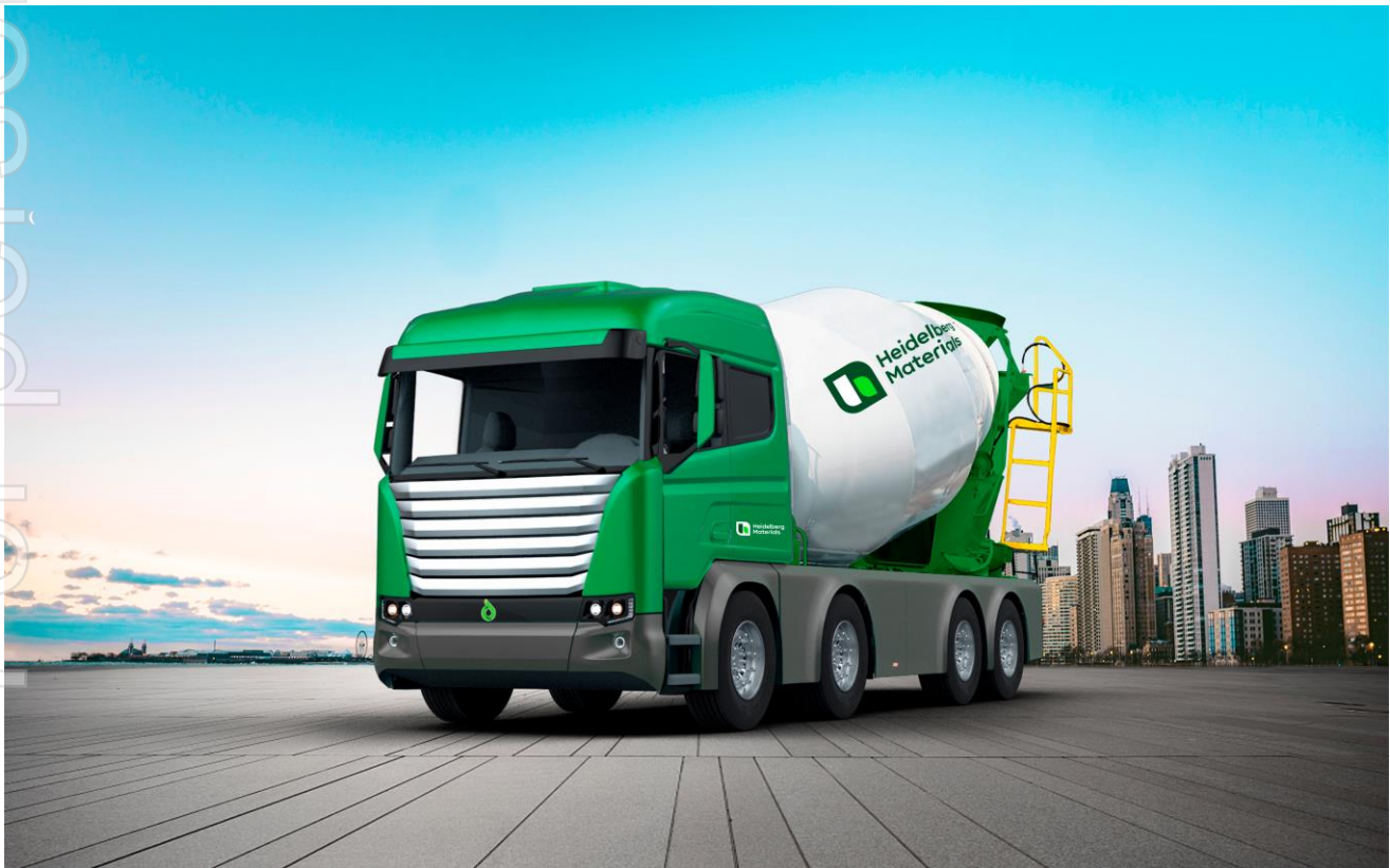
A similar version of the HFC truck to be supplied to Heidelberg Materials