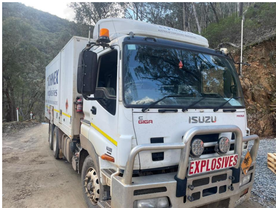
Figure 3 Explosives being delivered to site to ramp up the underground gold feed.