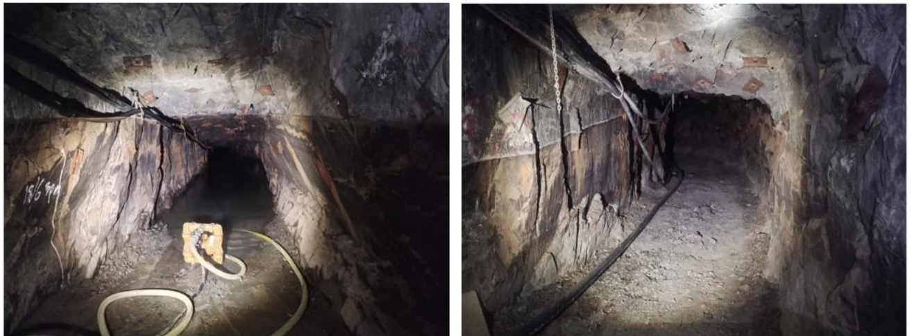
Figure 5 Mica Lense decline now dewatered. One of three gold bearing declines that carry reef gold and will be mined by flatback mining methods.

As previously announced, the startup mine schedule includes mining 2,075 tonnes at 17.8 g/t Au from a developed airleg stope block. The planned stope width is the same as the interpretation of the mineralisation. Refer to VTX ASX announcement 4 th June 2025