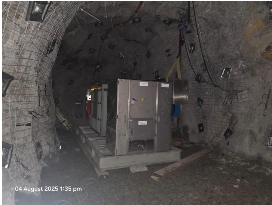
Figure 2 - 110kW primary ventilation fan installed and cabled up to the external power source