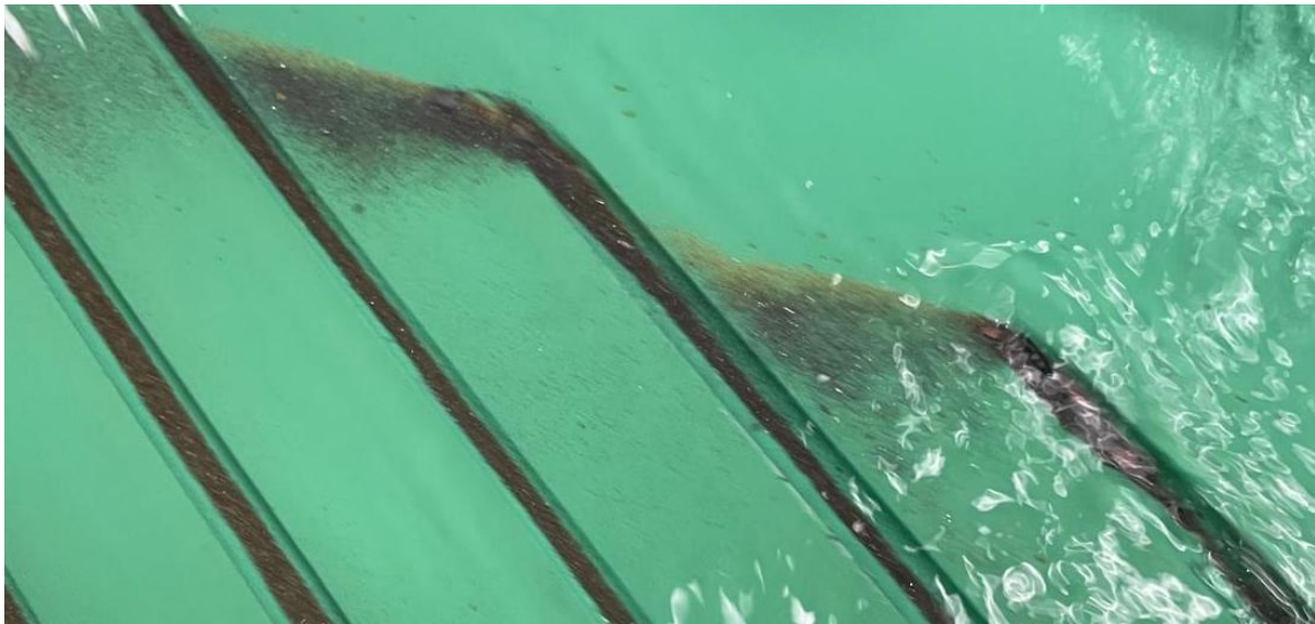
Figure 4 Coarse free gold recovered by gravity on the Gemini table at the Reward Gold Mine. The gold is being won from pre high grade underground production processing of the low-grade stockpiles.