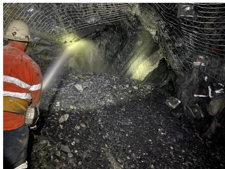
Figure 1 –Lady Belmore Reef being charged up and hosing down the ore (post blasting).