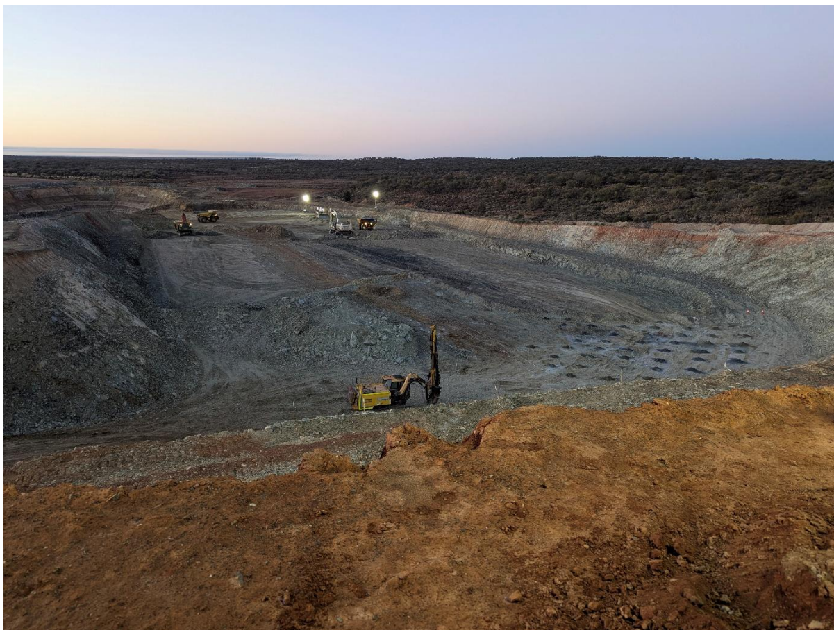
Visual ore (brown streak) marked out in the Devon Pit floor between grey waste rock (7 August 2025)