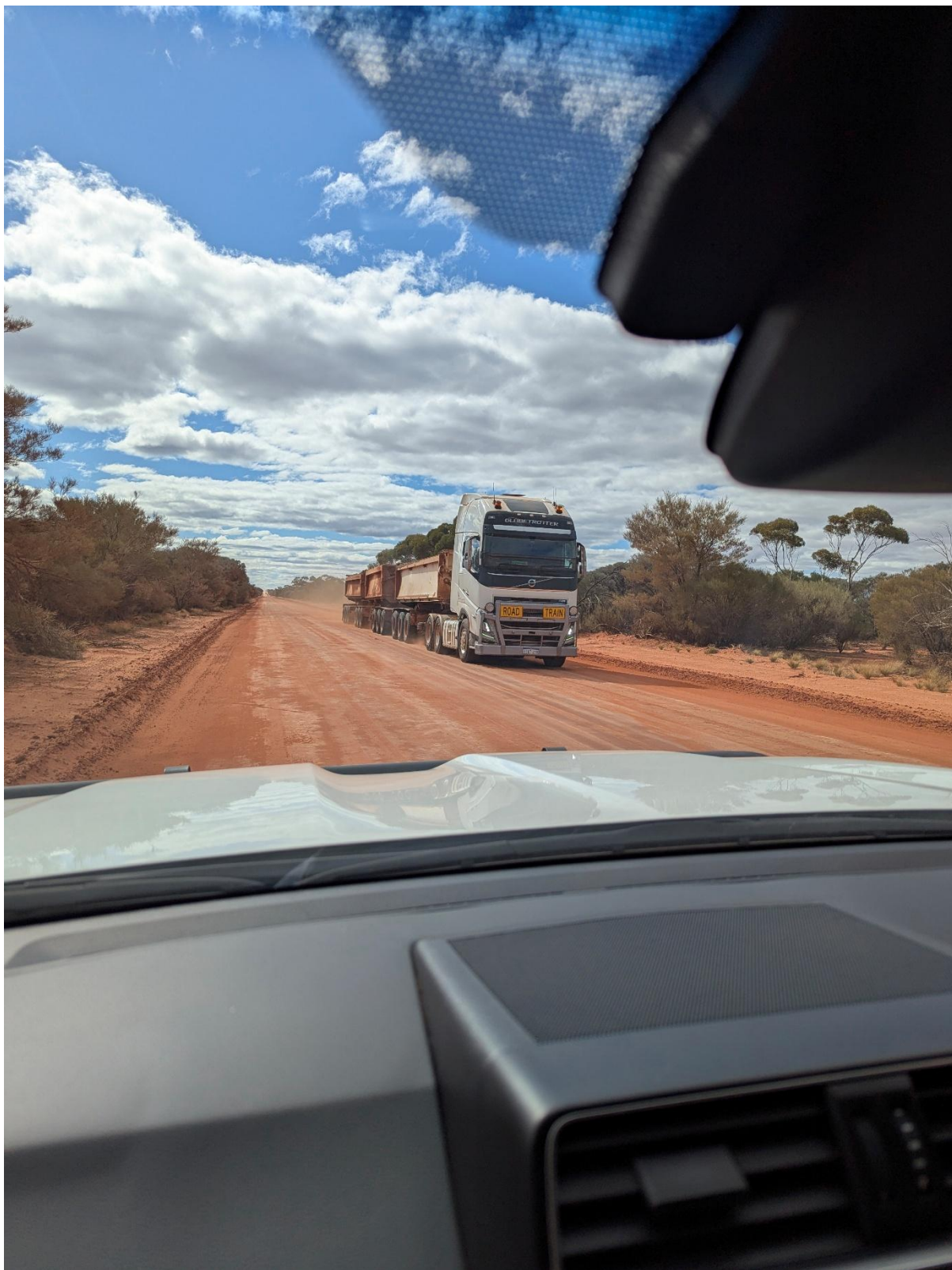
Road Train enroute to FMRs' Greenfields processing plant (7 August 2025)