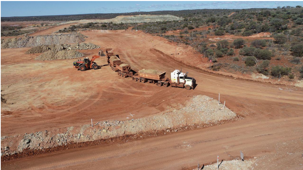
Devin Pit Gold Mine ROM loader and road train (7 August 2025)