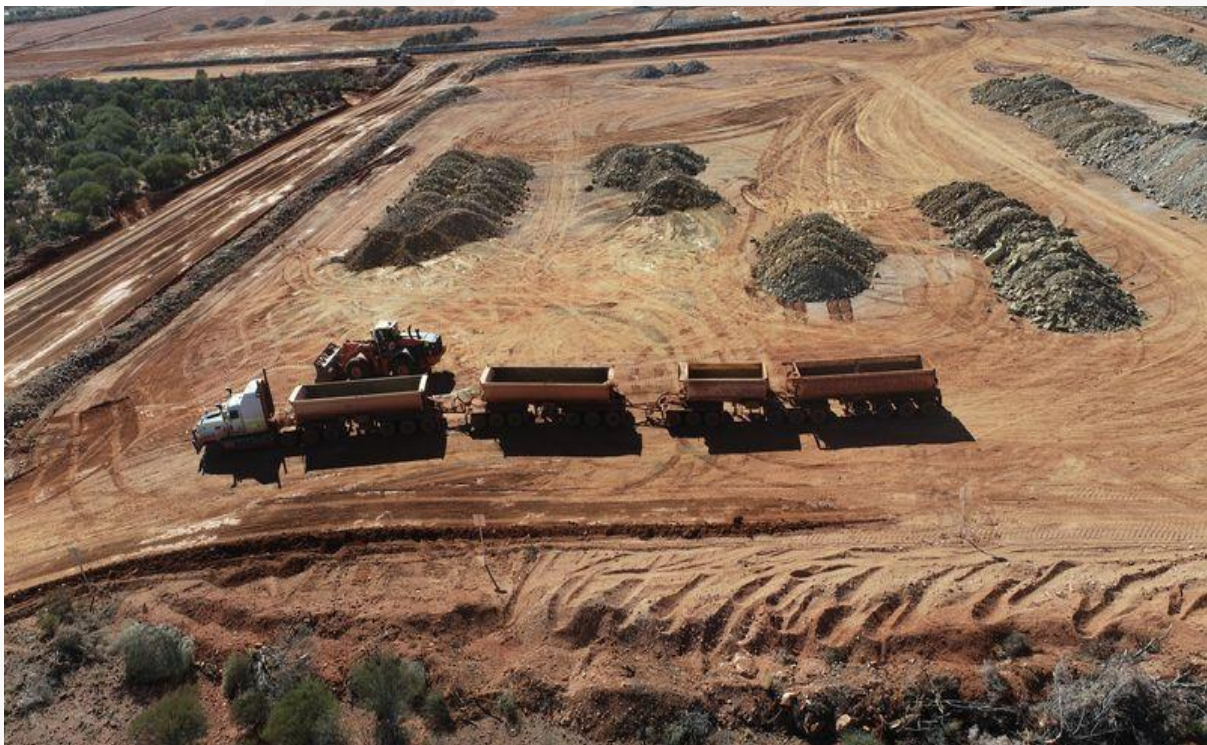
Loading a 4 trailer road train (quad) of approx. 100t at the Devon Pit Gold Mine (7 August 2025)

Once this first campaign has been completed, Matsa will assess it’s other projects for opportunities to bring them into production leveraging off the current Devon operation. Matsa is in a good position right now, has a great project in Lake Carey and we’re excited with the prospects ahead as we transition into a producer.”