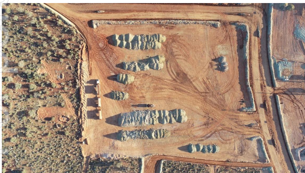
Drone view of Devon ROM Pad showing ore stocks and road train (left in photo – 6 August 2025)