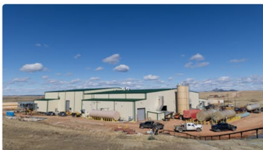
Central Processing Plant (Phase I & II)