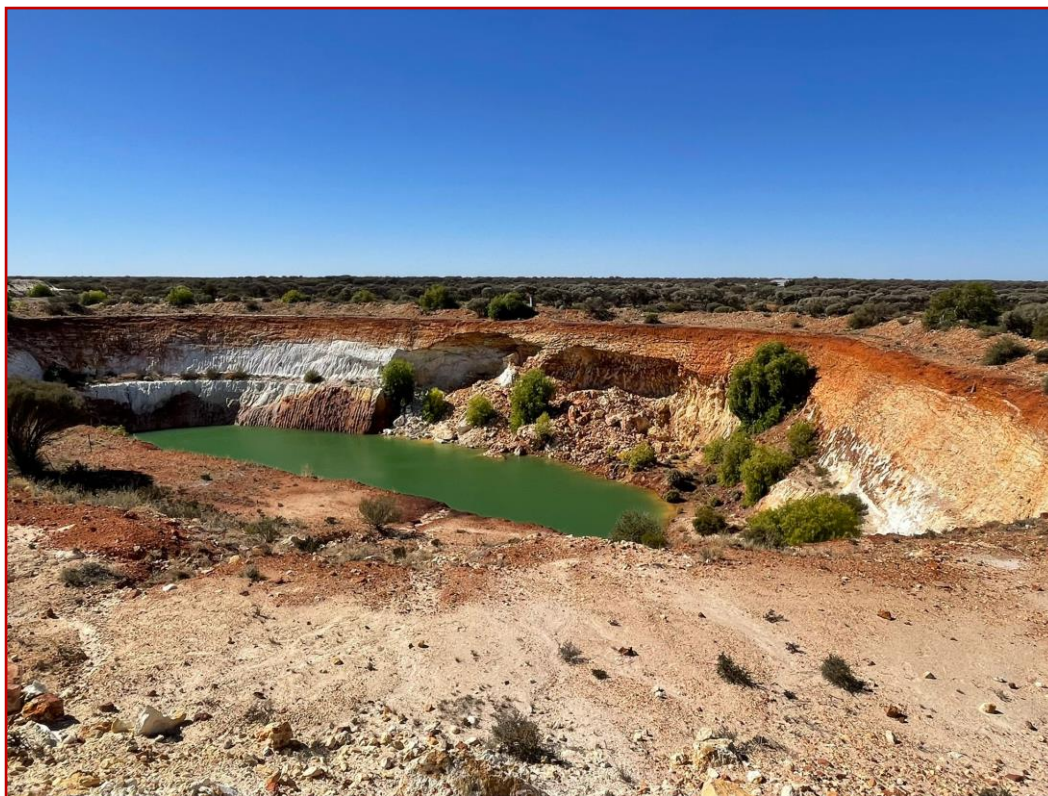
Figure 4: Historic pit along Cosmopolitan trend (Diamantina)