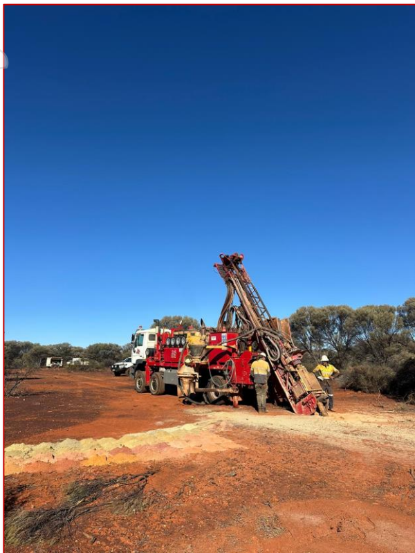
Figure 2: Aircore Drilling Commences