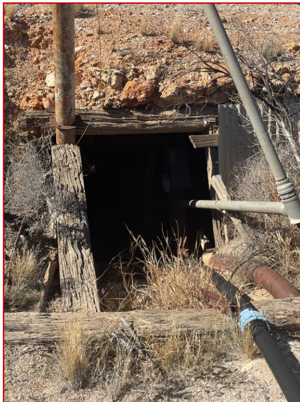
Figure 3: Historic Shaft at Cosmopolitan