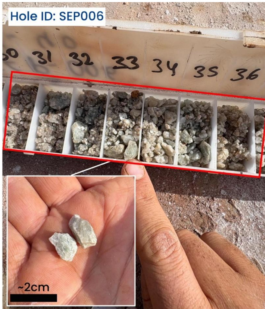
Figure 1: Coarse spodumene visually interpreted in RC drillhole SEP006 at 33 m depth, SE Anomaly. SEP006 intersected 44 m of continuous pegmatite, including a 12 m interval with interpreted coarse green spodumene observed from 29 m to 41 m. Refer to Appendix A – Rock Type Descriptions for further details. (Representative RC chip sample; visually interpreted spodumene; assays pending).

Exploration Cautionary Statement Visual observations and mineralogical interpretations are based on preliminary geological logging of RC drill chips and are qualitative in nature. Visual estimates of mineral abundance should never be considered a proxy or substitute for laboratory analyses where concentrations or grades are the factor of principal economic interest. Visual estimates also potentially provide no information regarding impurities or deleterious physical properties relevant to valuations. No chemical analyses have yet been received to confirm the presence, concentration, or grade of spodumene. All geological information remains subject to confirmation through certified laboratory assays.