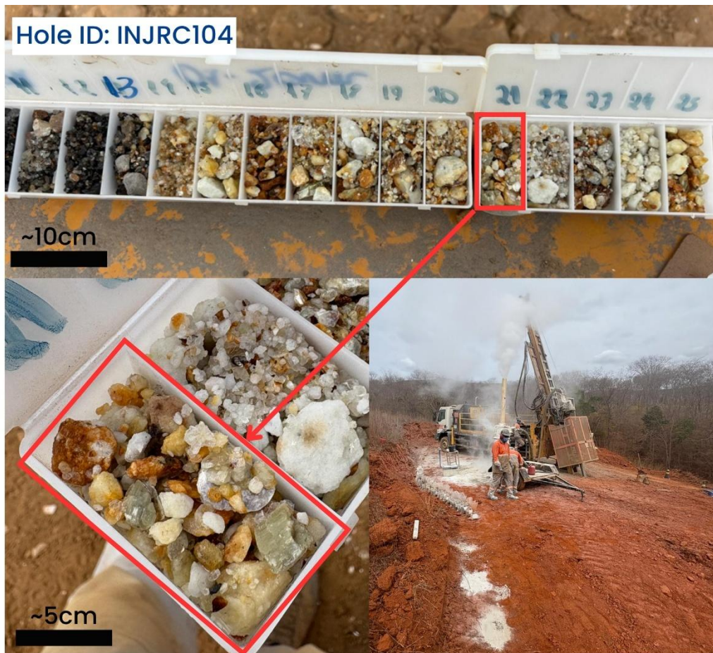
Figure 4: Spodumene visually interpreted in RC drillhole INJRC104 at 21 m depth, Target 1 (top/bottom left). Drilling at Igrejinha Project (bottom right). Representative sample, not the whole interval. Assays pending. Refer to Appendix A – Rock Type Descriptions for further details.