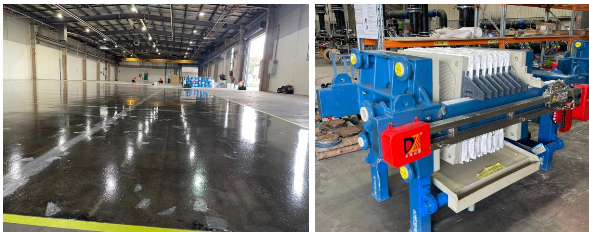
Figure 1. Site preparation works at PSG demonstration facility in Adelaide (left) and filter press at laydown facility in Adelaide (right)

Renascor Resources Limited (ASX: RNU) ( Renascor ) is pleased to announce the achievement of key milestones in the development of its Australian Government co-funded Purified Spherical Graphite ( PSG ) demonstration facility in Adelaide, South Australia.