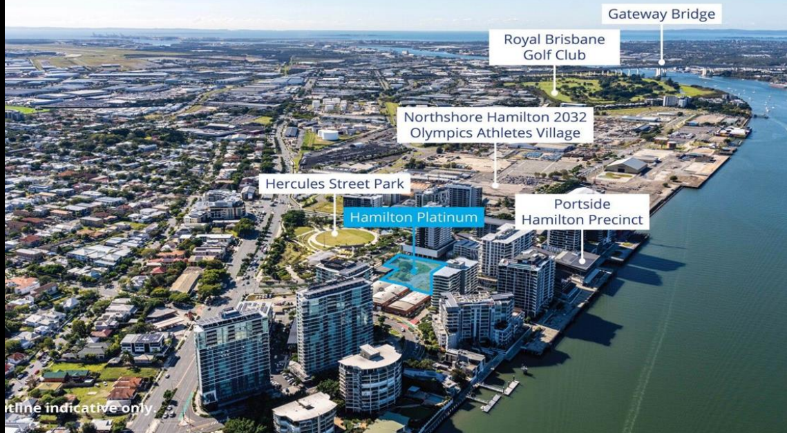
19 Hercules Street, Hamilton