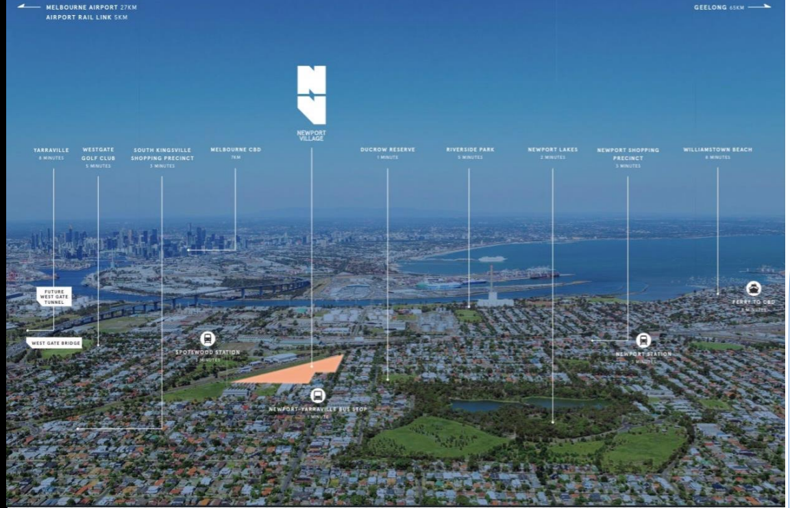
Kings – Newport Village