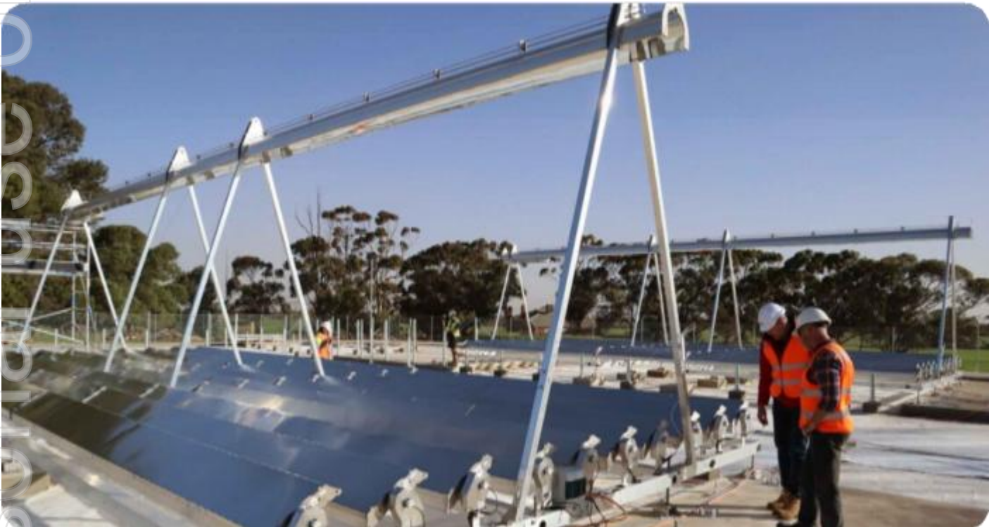
Figure 1: Roseworthy pilot plant as at June 2025

With a solid financial and operational platform laid during FY25 Sparc Hydrogen is in a strong position to leverage its market leading position in the scale-up and commercialisation of PWS which has the potential to revolutionise green hydrogen production. The focus for Sparc Hydrogen during FY26 will be on establishing consistent operation of the Roseworthy pilot plant and deepening collaborations with photocatalyst suppliers targeting testing and co-development whilst looking towards further scale up and commercialisation of the technology.