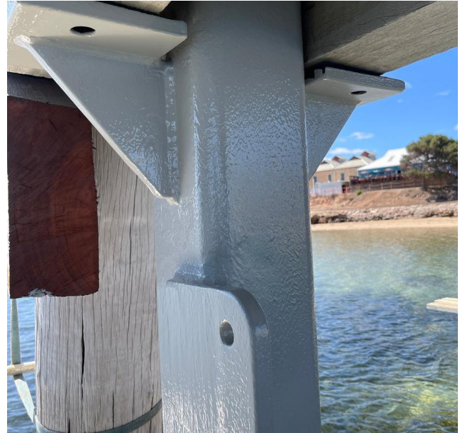
Figure 2: Photos of ecosparc® field trial infrastructure.

In addition to commercialisation activities for ecosparc®, the Company progressed its strategy of diversifying research and development activities into adjacent markets leveraging our deep expertise within graphene-enhanced polymer materials, including: