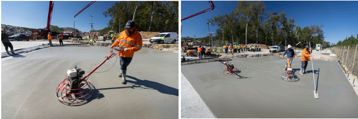
Figure 2: Finishing Work at the AusPozz™ Commercial-Scale Concrete Demonstration Pour

Attendees observed the performance of the AusPozz™ mix design in a large-scale concrete pour, assessing key factors such as workability, setting time, strength development, and durability, while also inspecting the completed slab poured two days earlier.