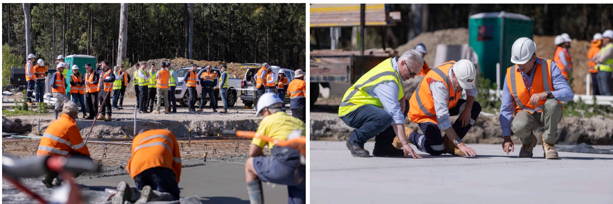
Figure 3: Attendees at the AusPozz™ Commercial-Scale Concrete Demonstration Pour

Feedback was overwhelmingly positive, with strong endorsement of the mix's handling, workability, and the quality of the finished slab. The demonstration also addressed key questions regarding the suitability of AusPozz™ and its potential applications across a range of concrete uses, while showcasing its potential to reduce both embodied carbon and cost per cubic metre.