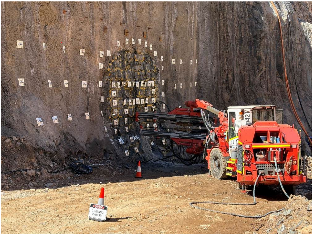
Figure 1: Majestic main decline portal, prior to firing.