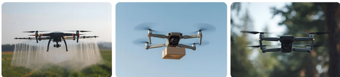
Figure 5: Potential use cases for ECS-DoT in Precision farming, Autonomous Delivery and Surveillance